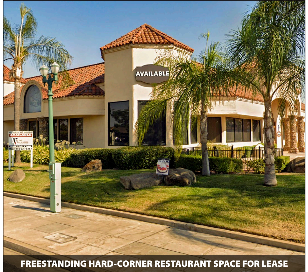
FREESTANDING HARD-CORNER RESTAURANT SPACE FOR LEASE