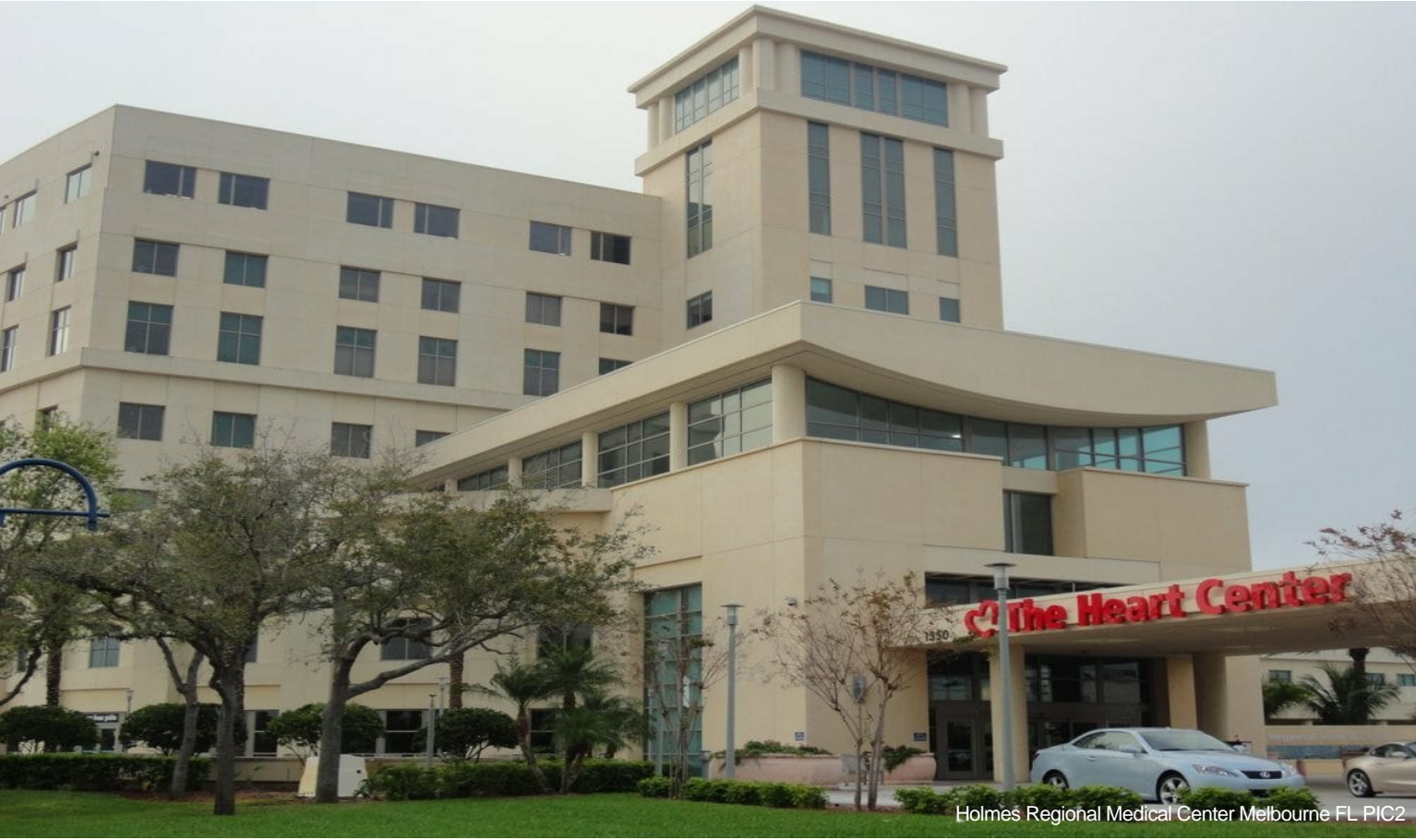
Holmes Regional Medical Center Melbourne FL PIC2