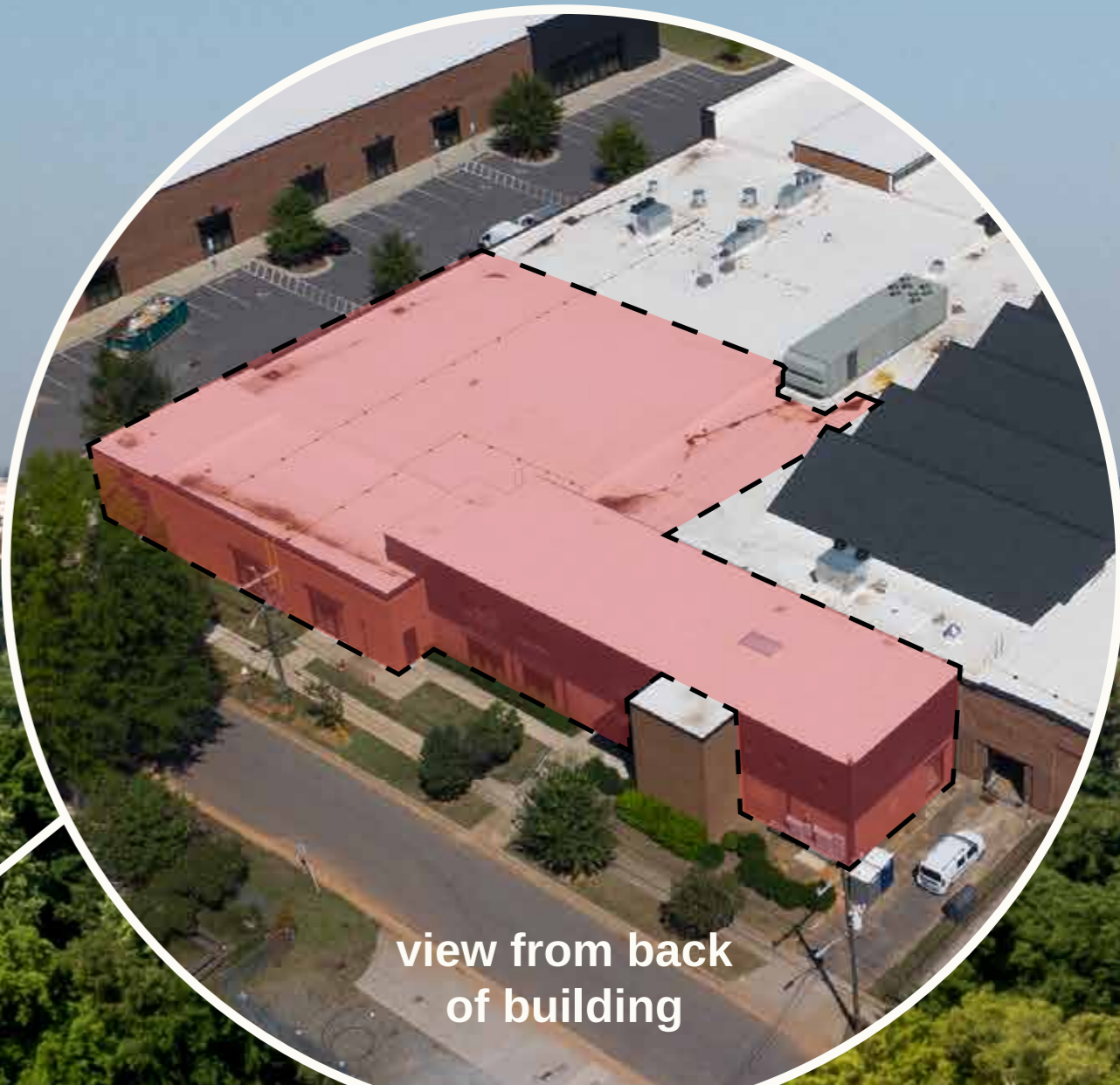
view from back of building

AVAILABLE SPACE: 1837 North Tryon Street, Charlotte, NC