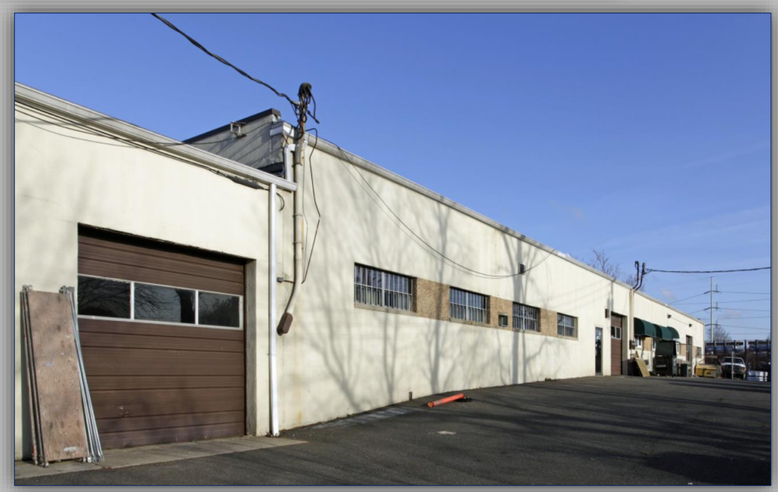
All information is subject to errors, omissions, modification, and withdrawal. Information is from sources deemed to be reliable but should not be relied upon without independent verification.