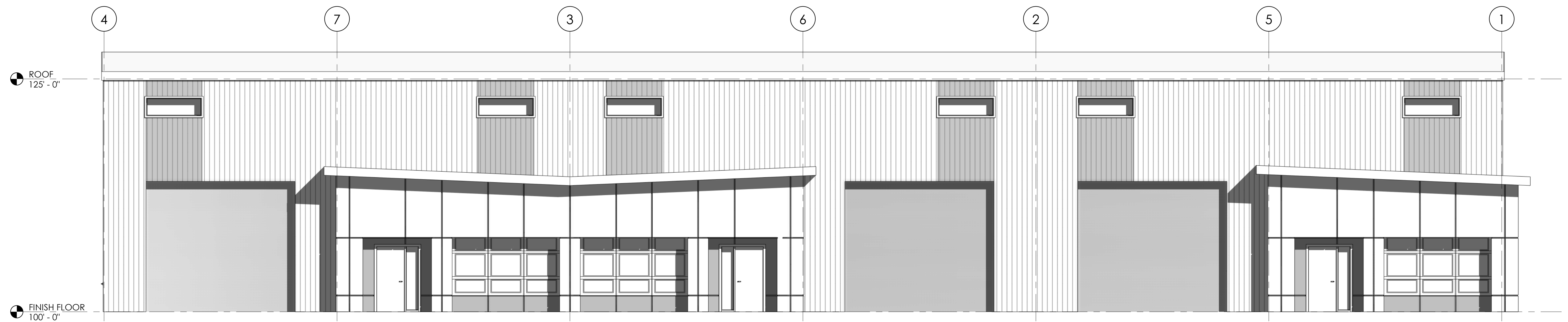
2 NORTH 3/16" = 1'-0"