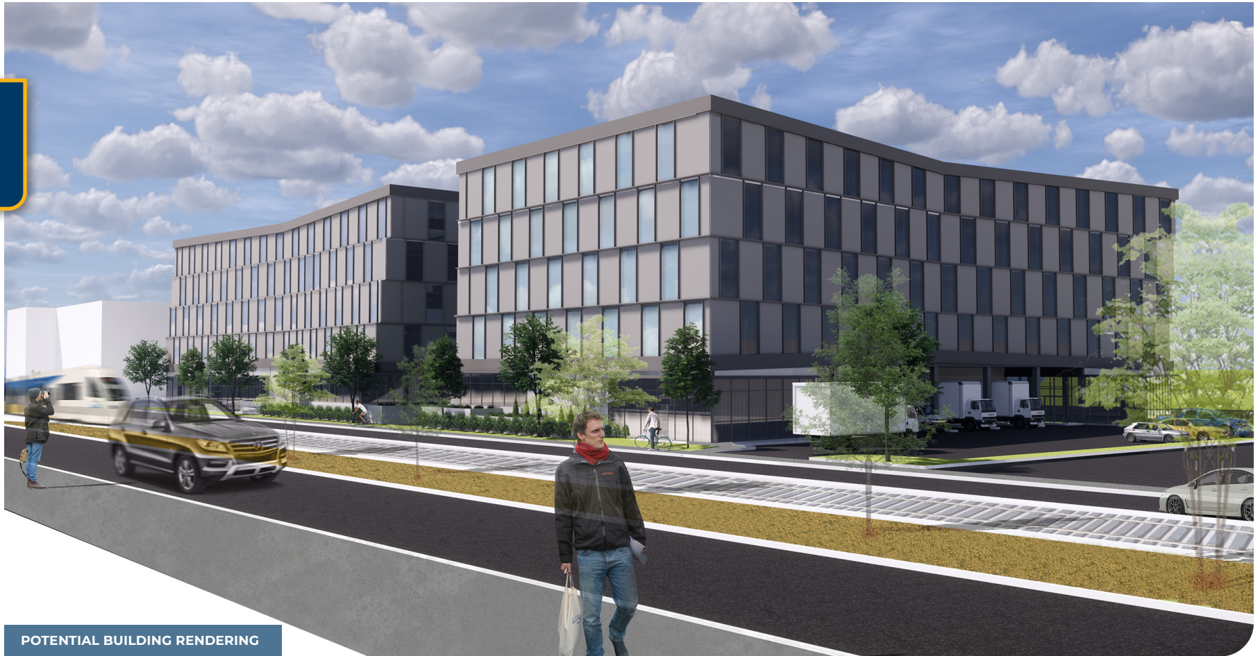
POTENTIAL BUILDING RENDERING