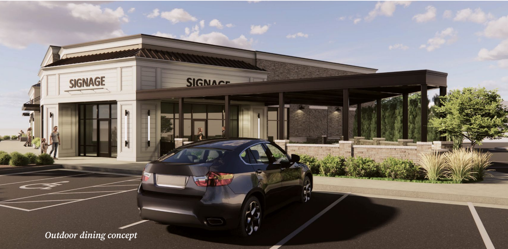
Outdoor dining concept