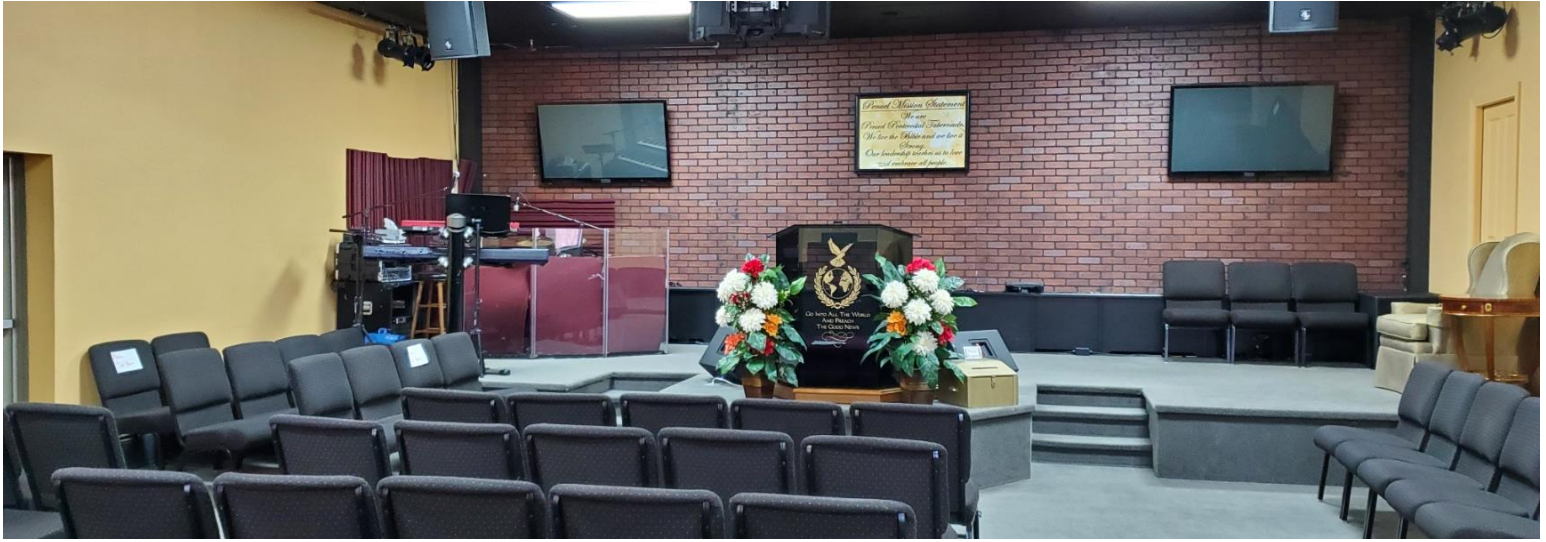
Sanctuary (Main level)