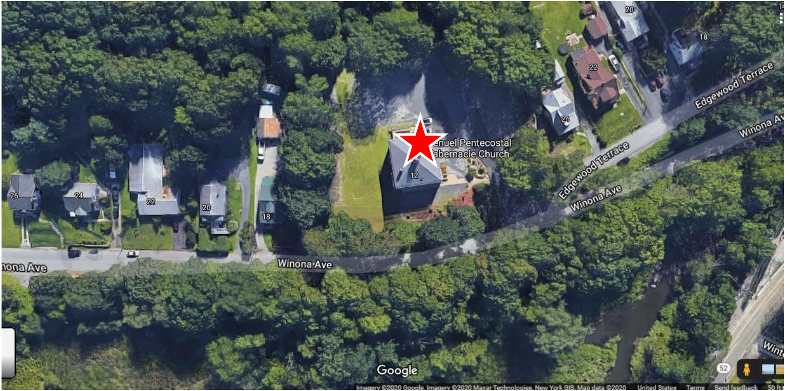
Bird's Eye Aerial View