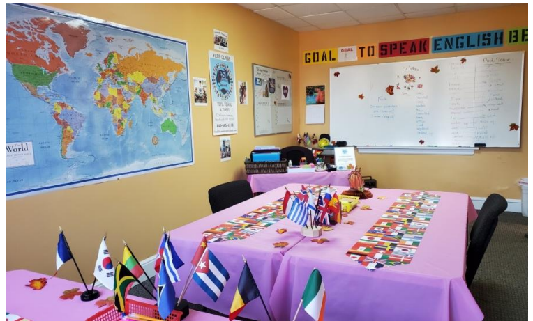
Classroom (Upstairs, 3 rd level)