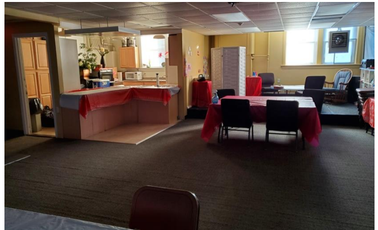
Meeting/Conference Room & Kitchen (Downstairs)