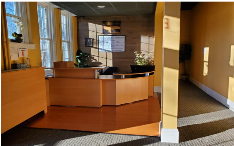
Reception/Foyer (Main level)