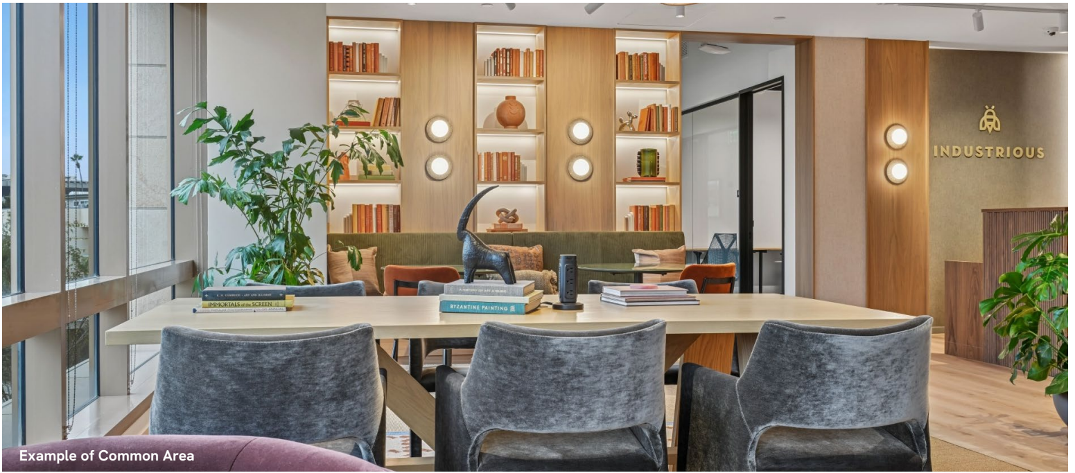
Example of Common Area