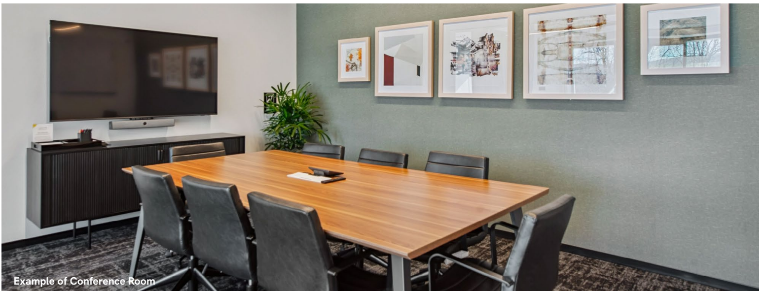
Example of Conference Room