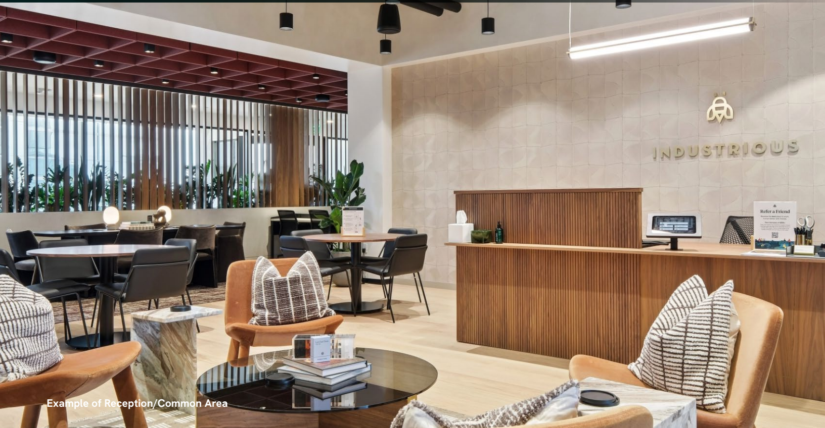
Example of Reception/Common Area