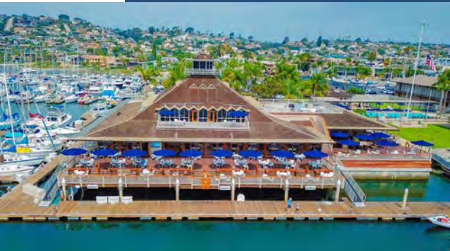
San Diego Yacht Club