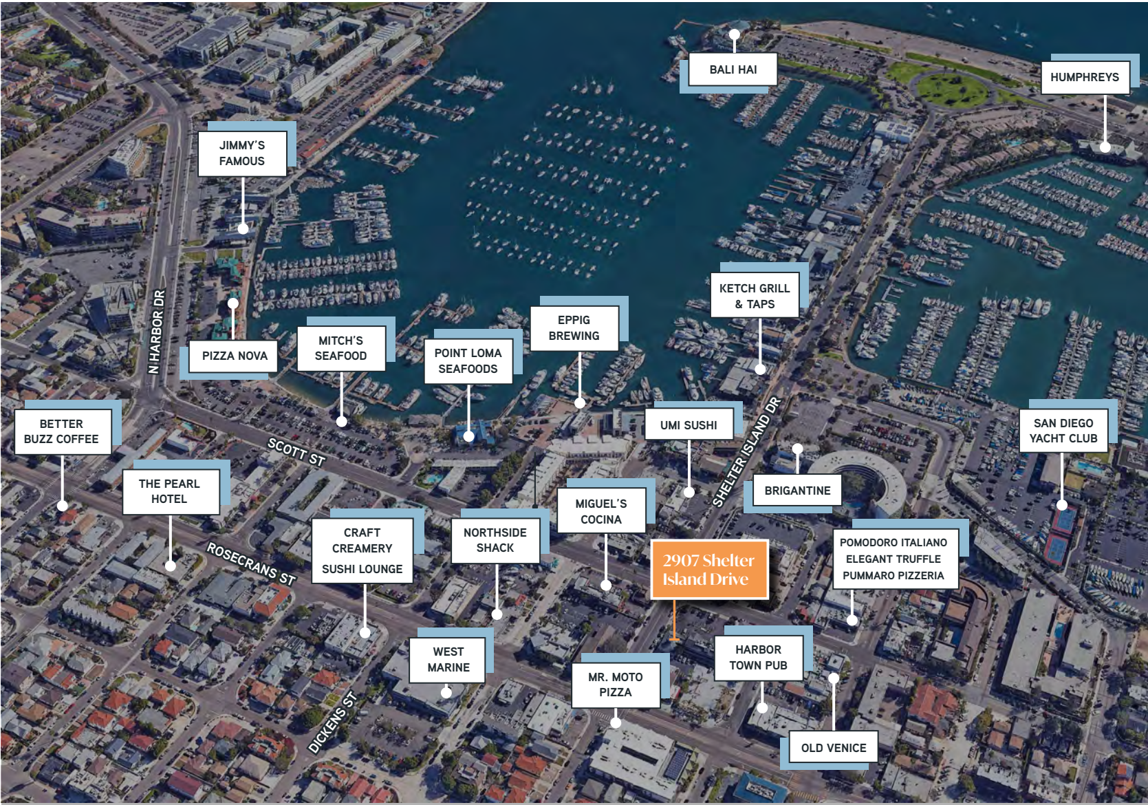
2907 Shelter Island Drive | Point Loma