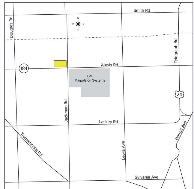
Building specs per Lucas County Auditor