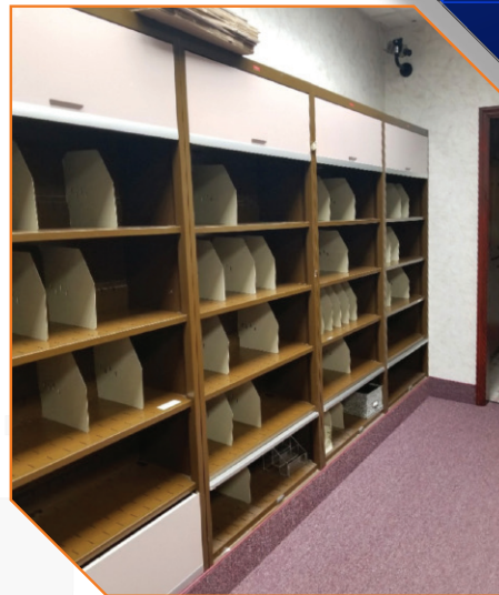
Built in file wall