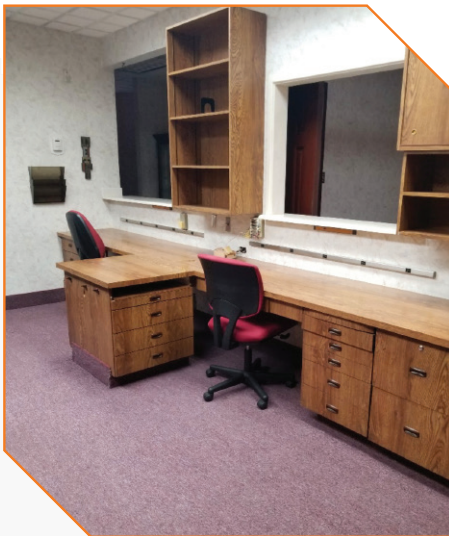
2 Reception counters