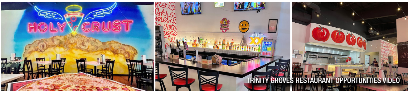
TRINITY GROVES RESTAURANT OPPORTUNITIES VIDEO