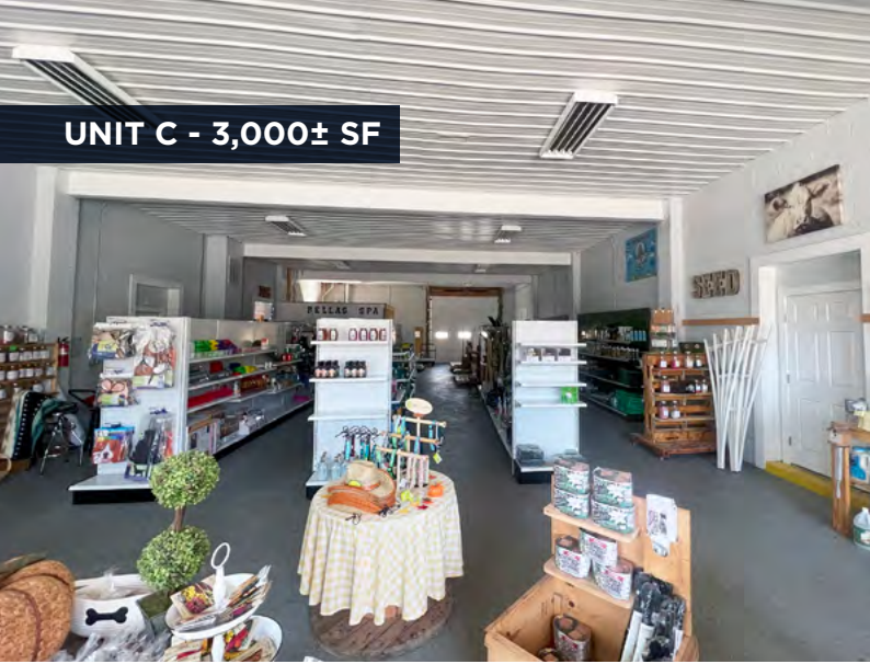
UNIT C - 3,000± SF