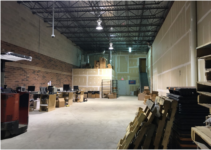
^ First Floor Warehouse ^