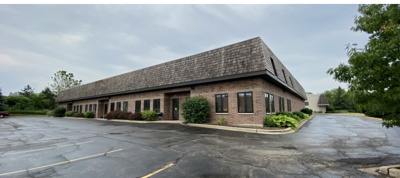
FRONT / MAIN ENTRANCE VIEWS TO UNIT 101 (CORNER UNIT)