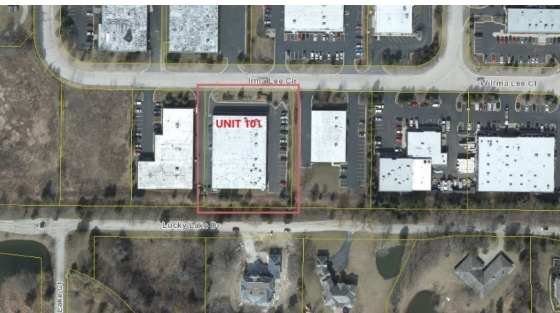
AERIAL VIEW OF BUILDING & LOT