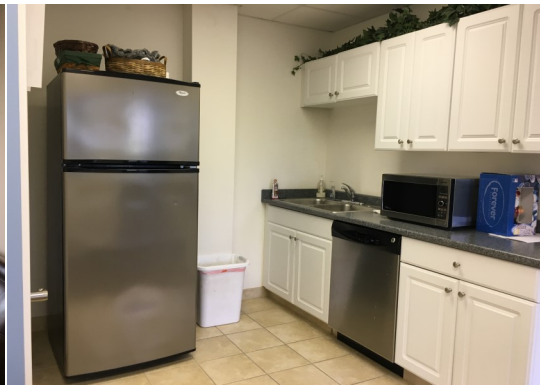
^ Break Room ^