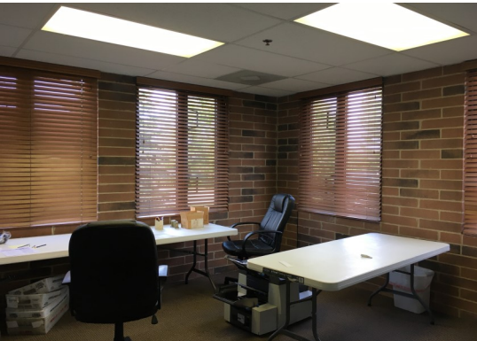
^ Corner Room #101 ^