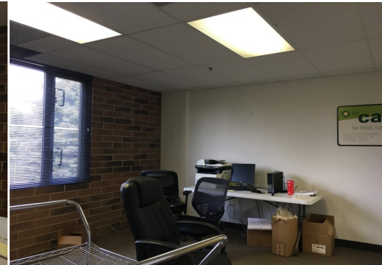
^ Room #113 ^