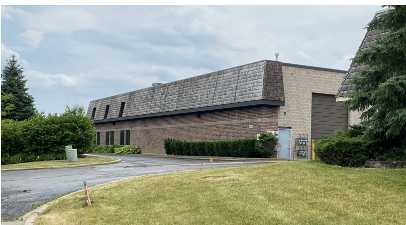
DRIVEWAY TO BUILDING / UNIT 101