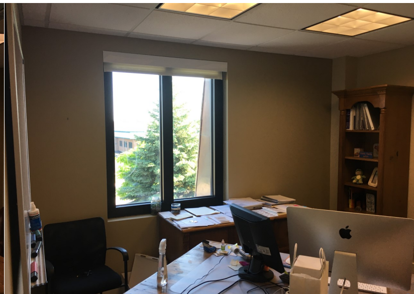
^ Office #1 Room 214 ^