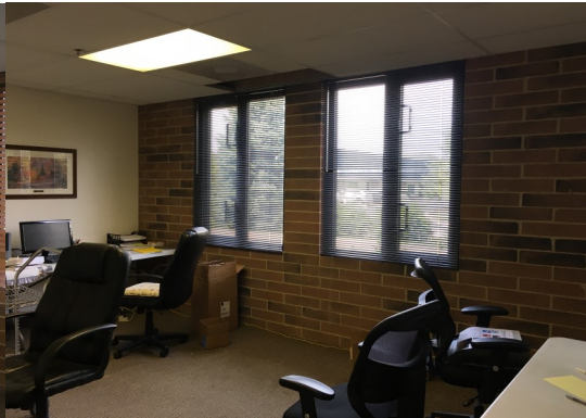
^ Room #113 ^