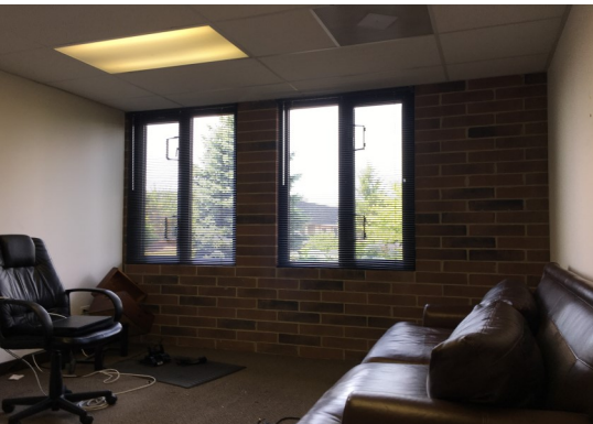
^ Room #112 ^