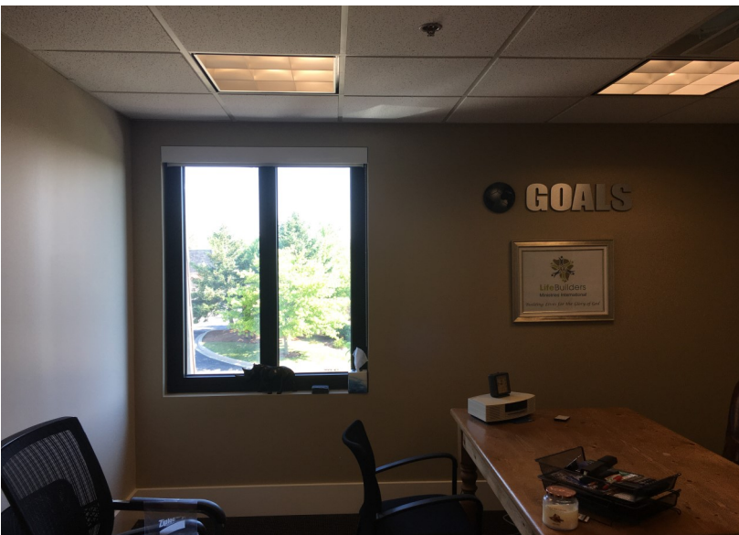
^ Office #2 Room 210 ^