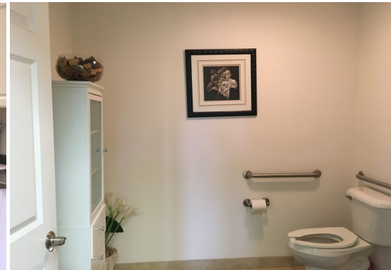
^ Women's Restroom ^