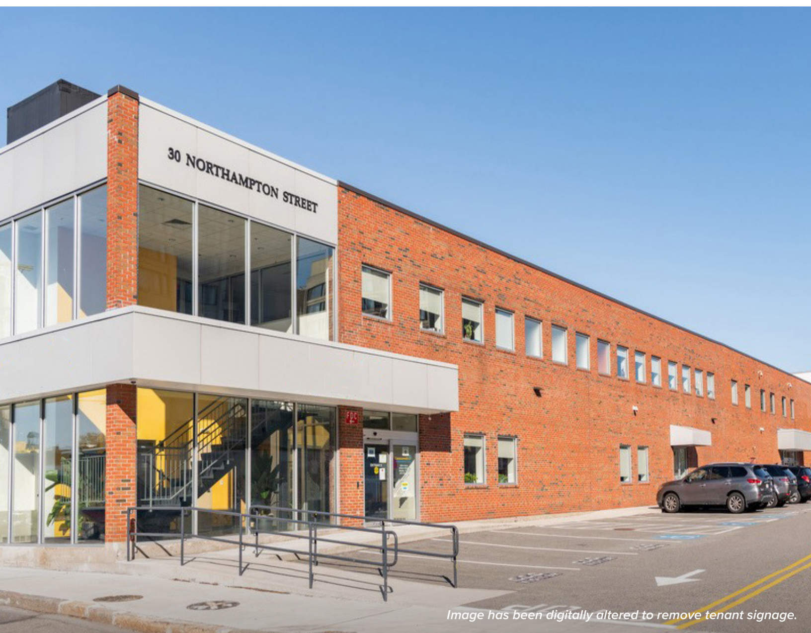
Image has been digitally altered to remove tenant signage.

±17,266 SF OF FULLY AIR-CONDITIONED SPACE AVAILABLE