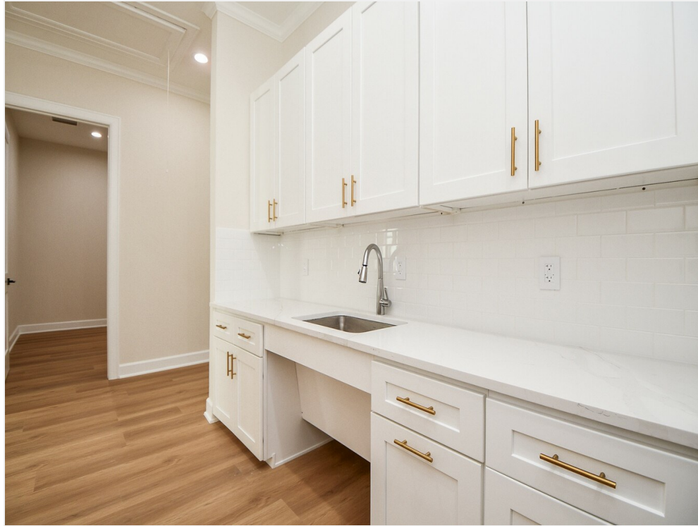
Kitchen Area with a Sink and Quartz Countertops