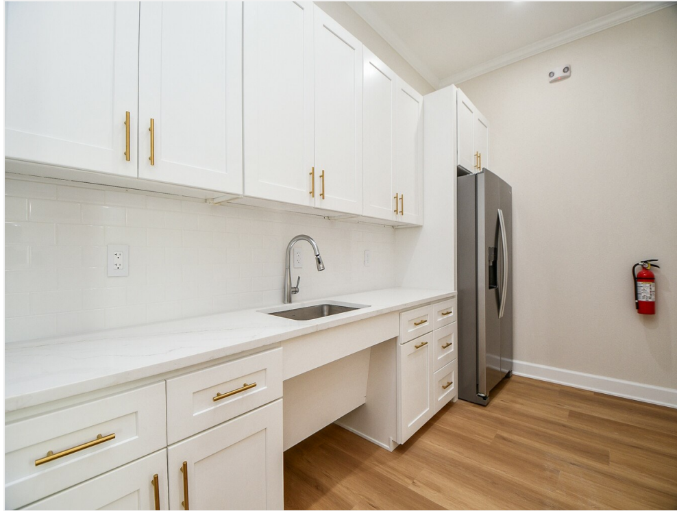
Kitchen Area coming with Stainless Steel Refrigerator