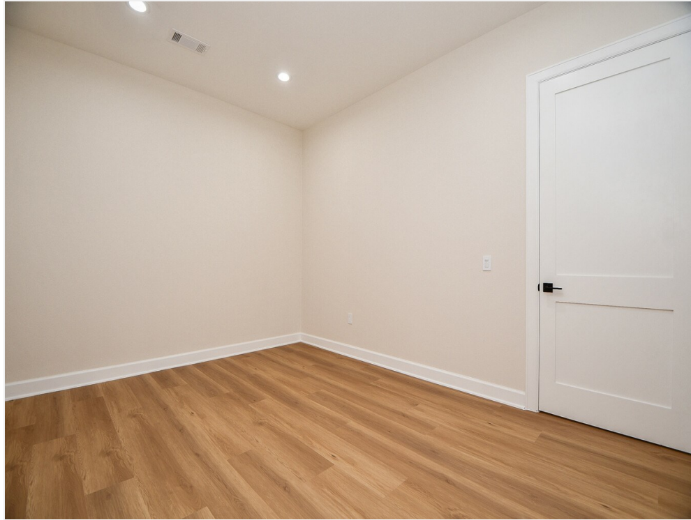
Private Office 1