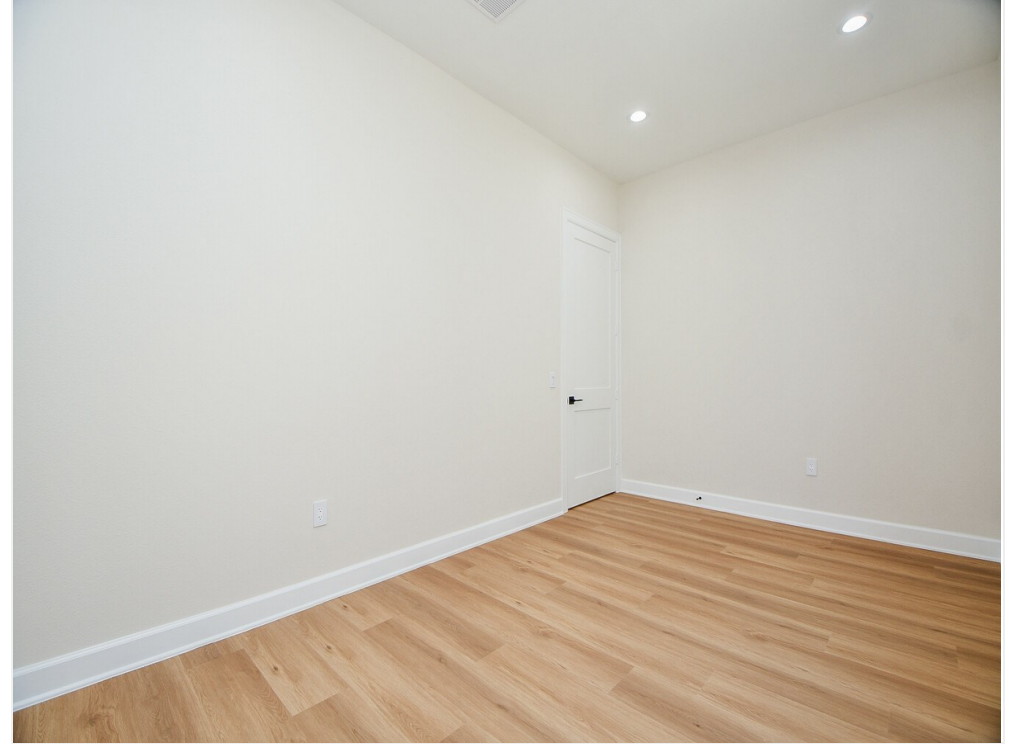
Private Office 2