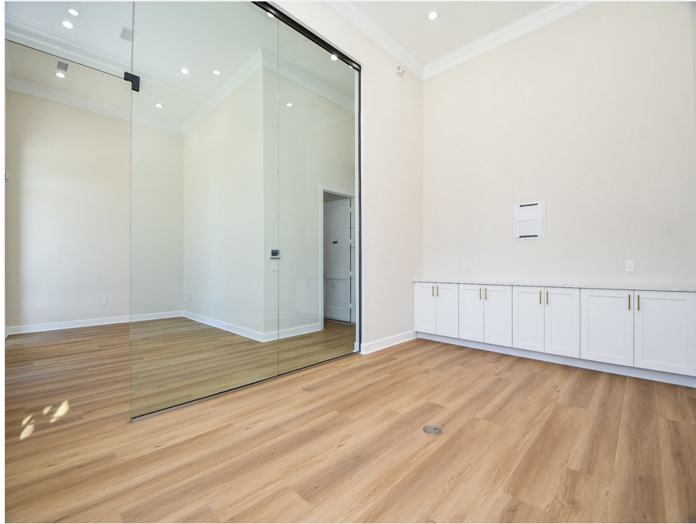
Conference Room with Built-in Cabinets