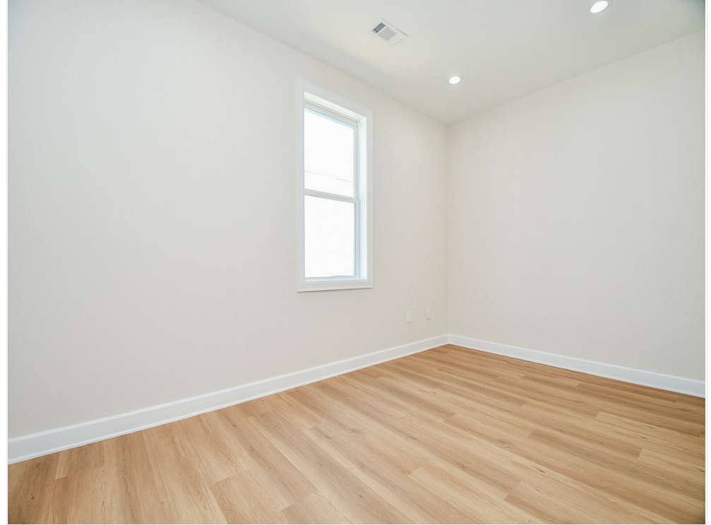
Private Office 2