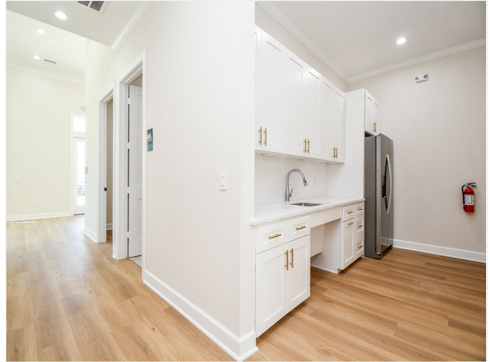
Kitchenette/Break Room Area