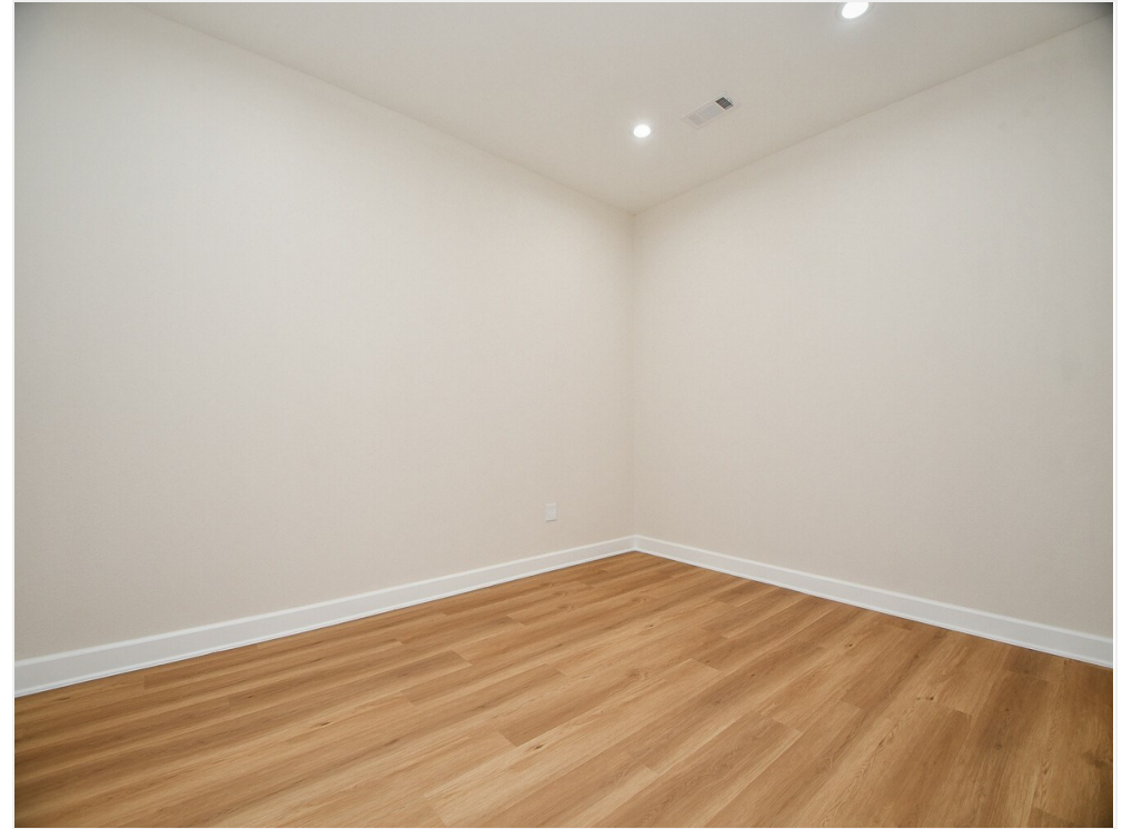
Private Office 1