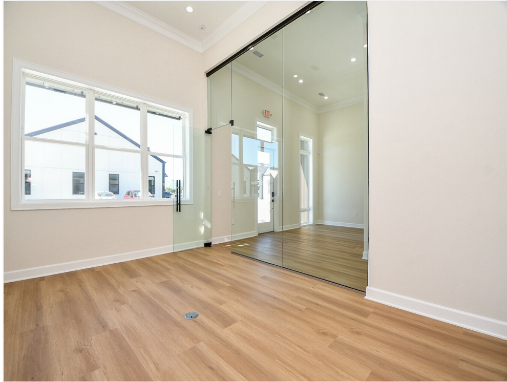
Conference Room with Lots of Natural Light