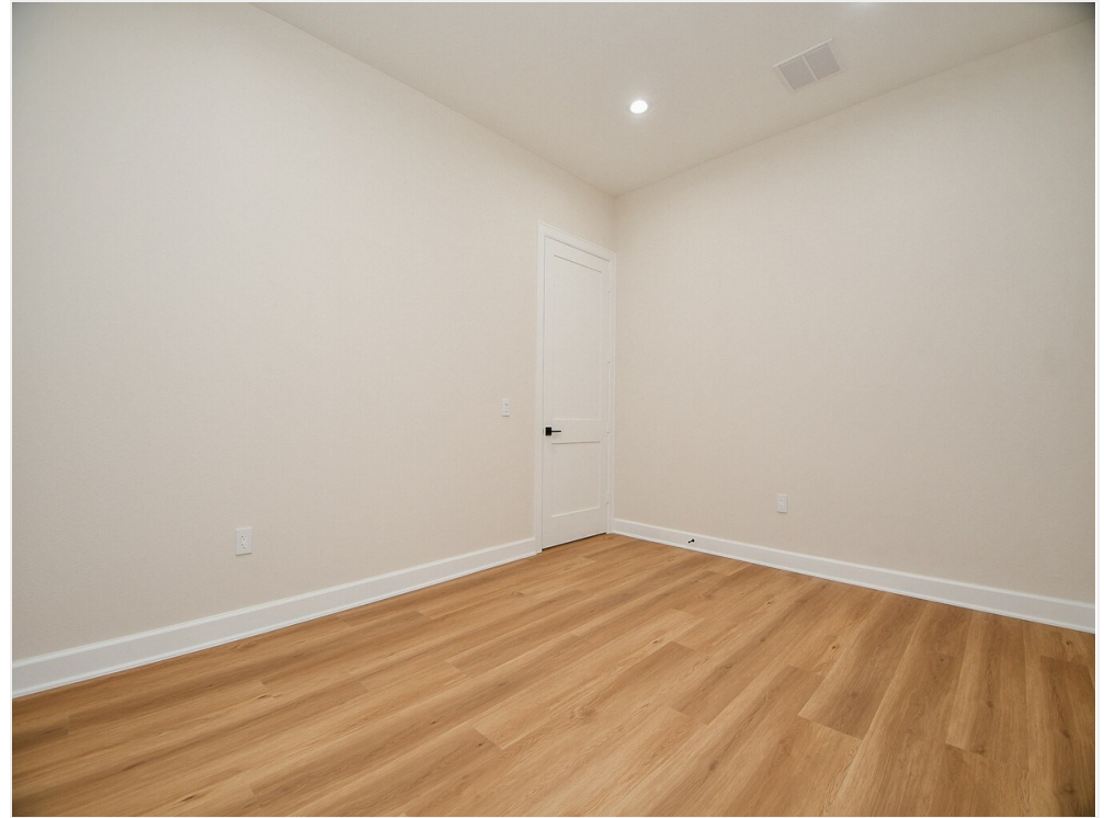
Private Office 1