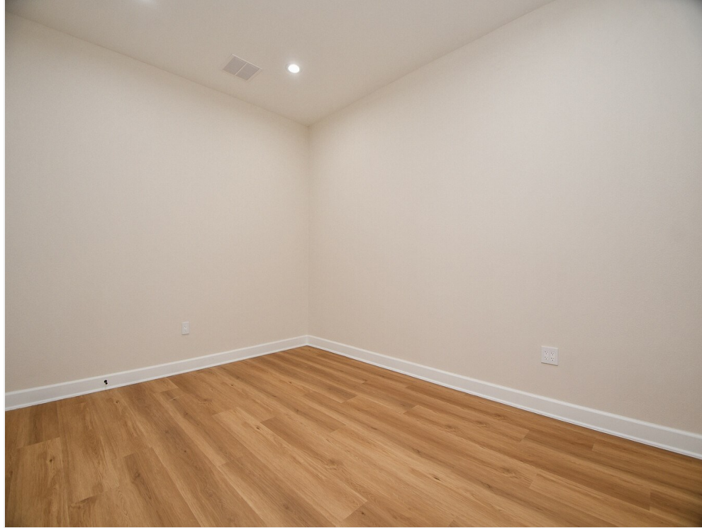
Private Office 2