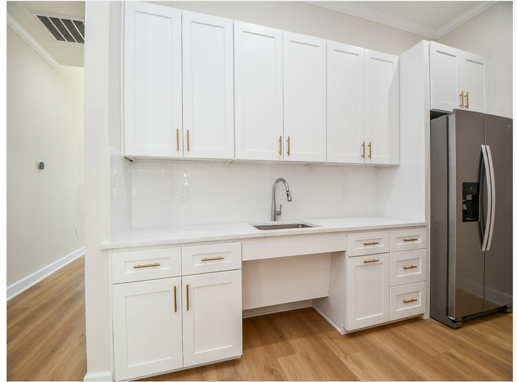
Kitchen/Break Room Space