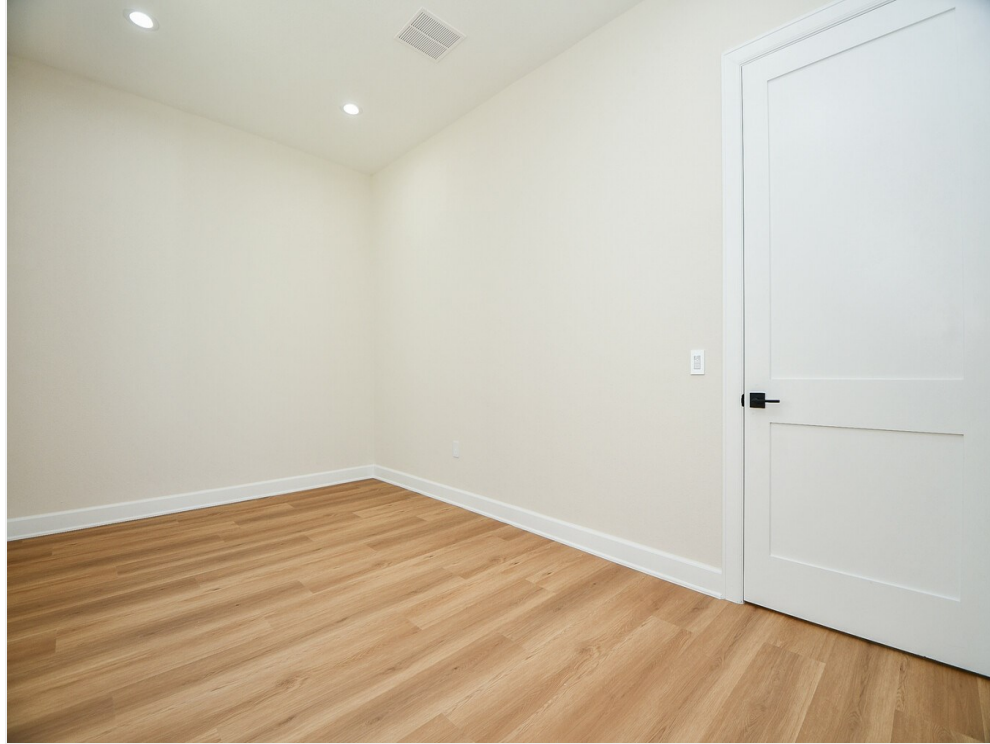
Private Office 2