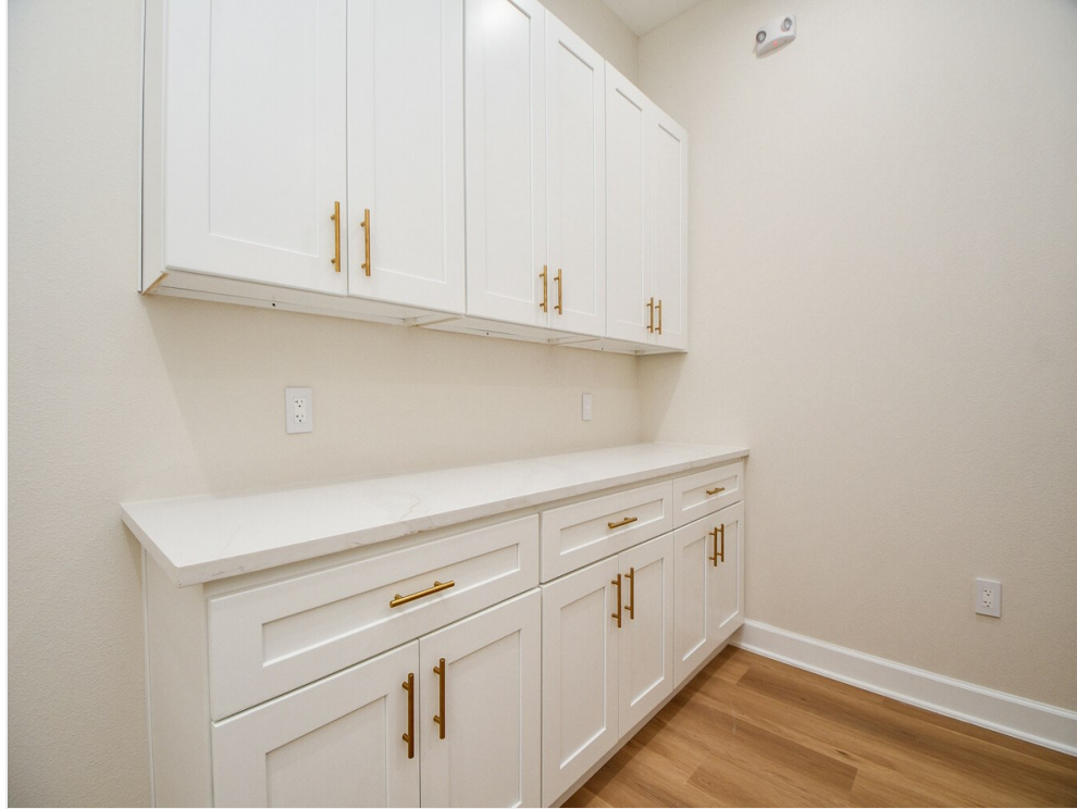
Copy/Flex Room with Built-in Cabinets