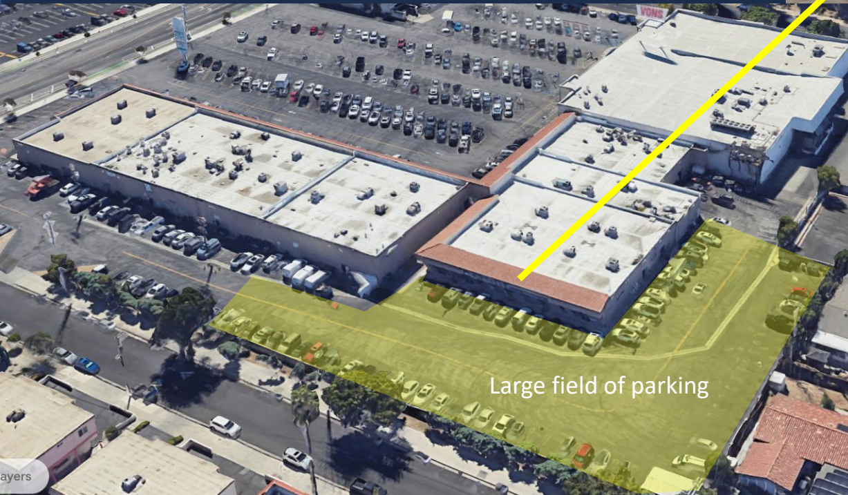
Large field of parking