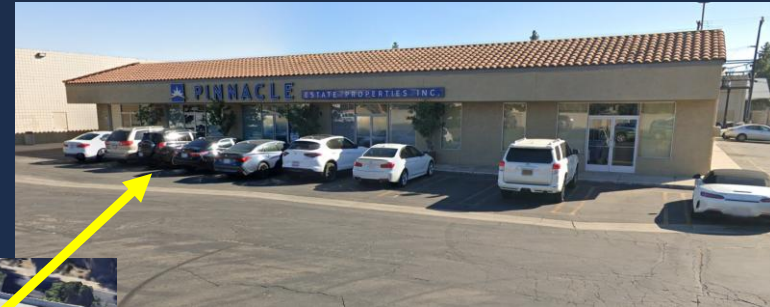
Rear Access and Signage