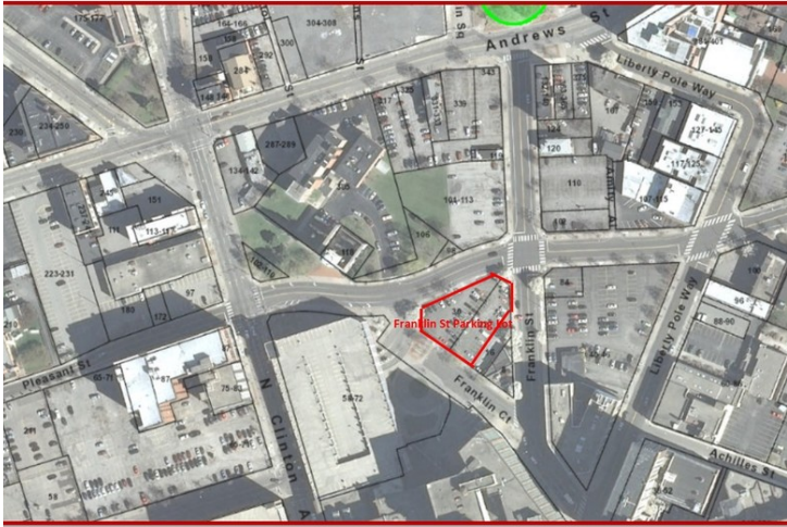
and 30 Franklin Court, Rochester NY Parking lot