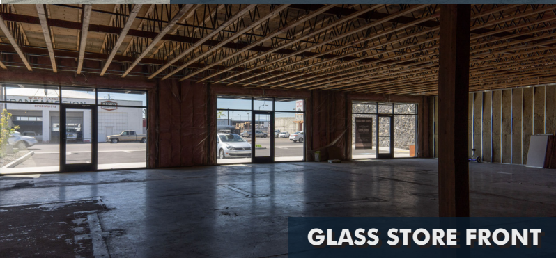
GLASS STORE FRONT

Beautiful glass facings for ample natural light and eye traffic from the street.