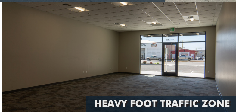
HEAVY FOOT TRAFFIC ZONE