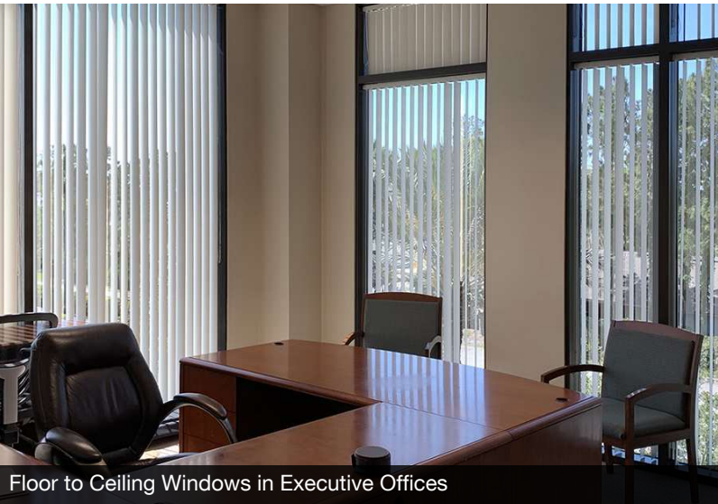
Floor to Ceiling Windows in Executive Offices