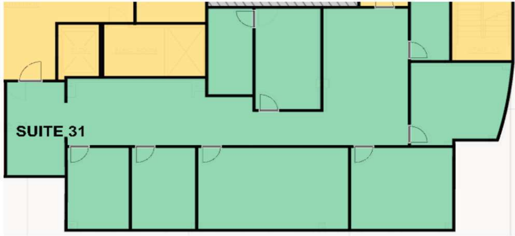
Suite 31 Available - 2,665 SF