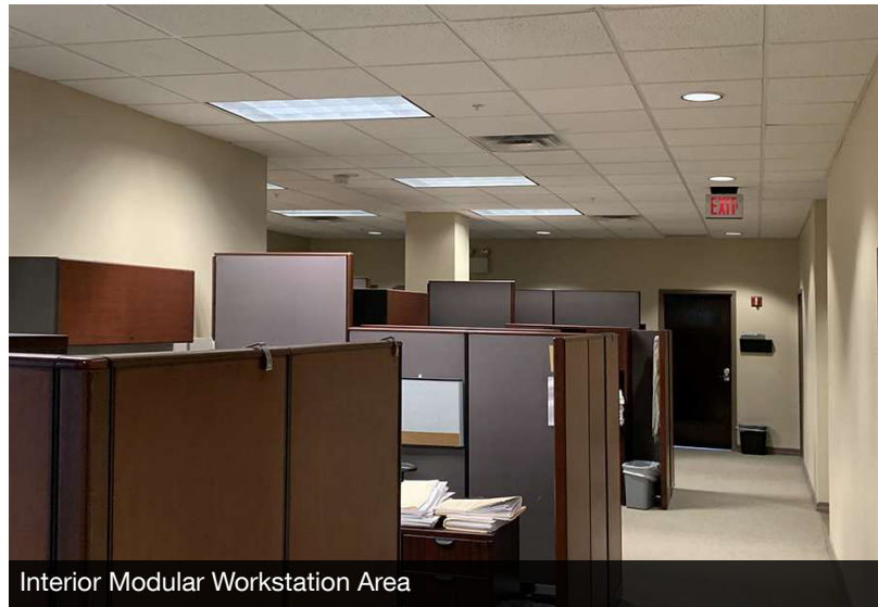
Interior Modular Workstation Area