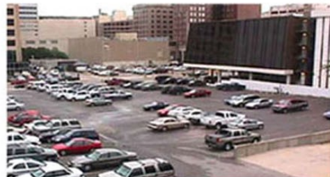
Lots of parking either doorside or garage!

Full Conference center included on this floor CURRENT FURNITURE INCULDED