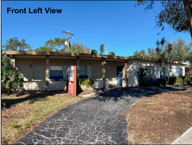
Front Left View