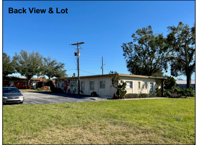
Back View & Lot