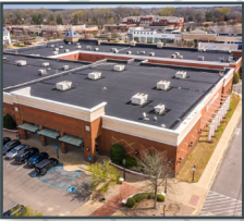
Former Bed Bath & Beyond Opportunity 28,307 SF