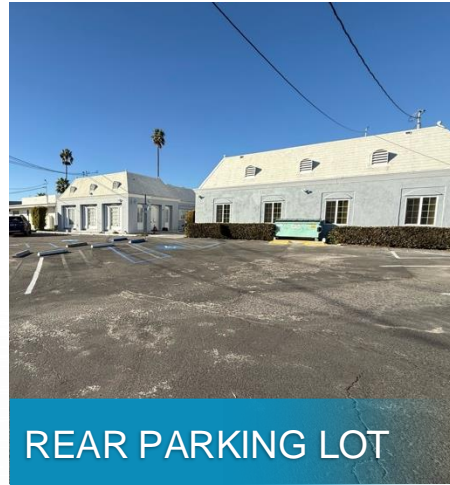
REAR PARKING LOT