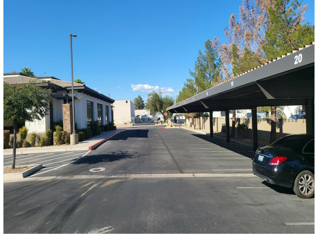
telmed 3 parking