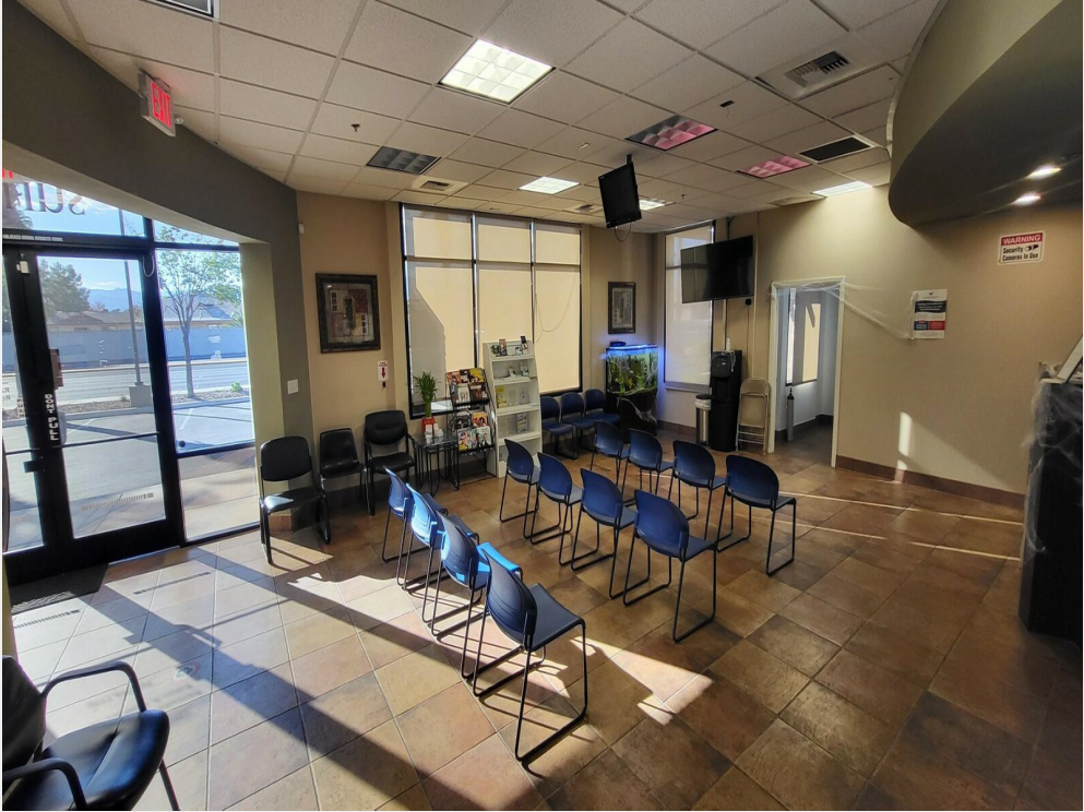
rapid care 2