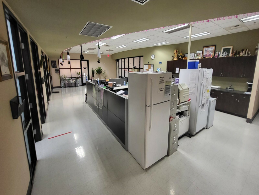
rapid care 4