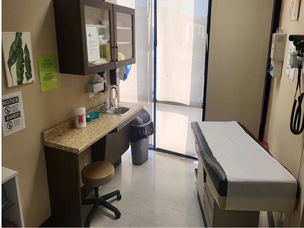
rapid care 3