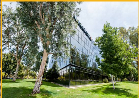
5201 California Avenue

California Triangle Building 5201 California Avenue - Bakersfield, CA