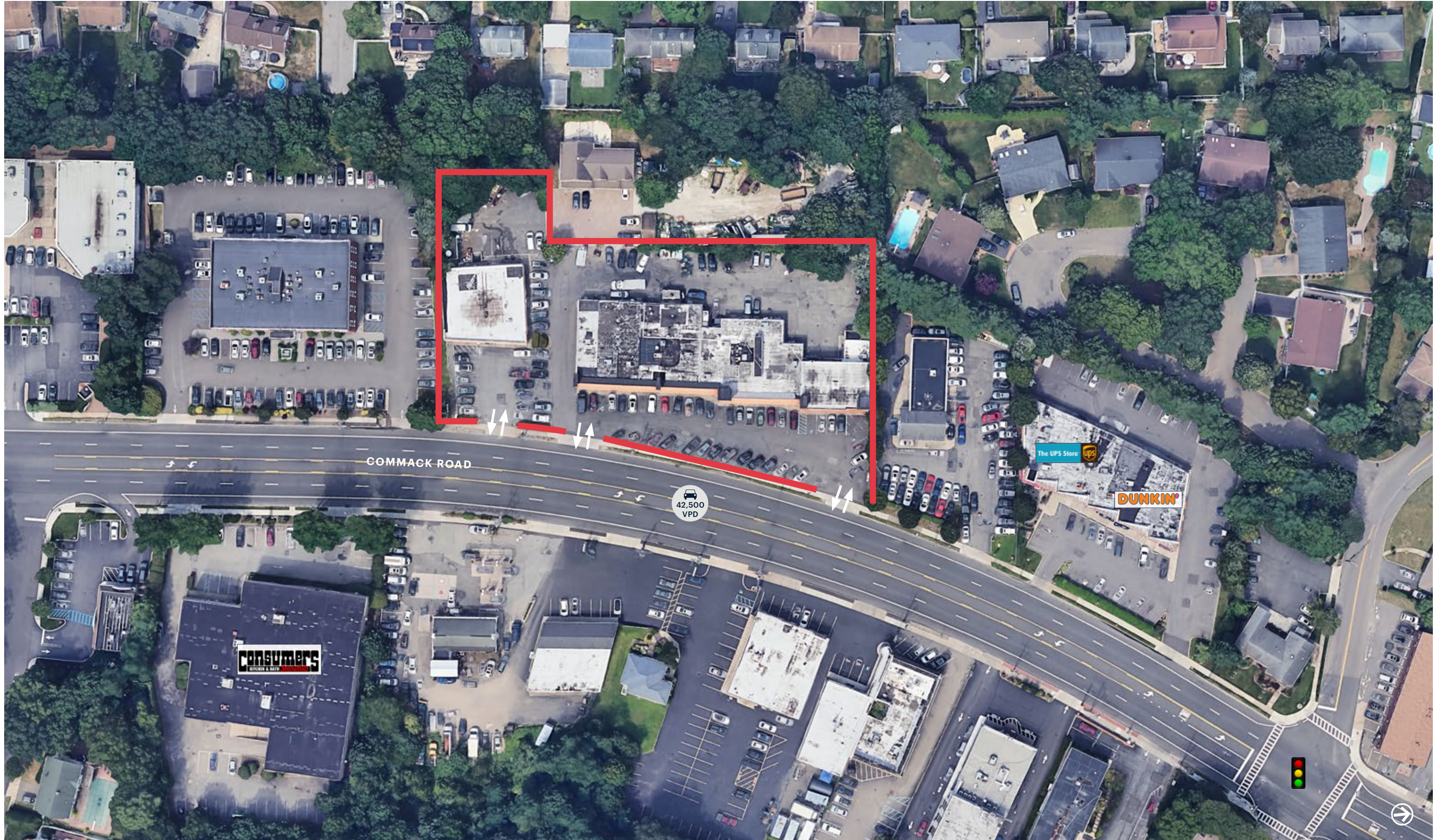
COMMACK COMMONS COMMACK, NEW YORK