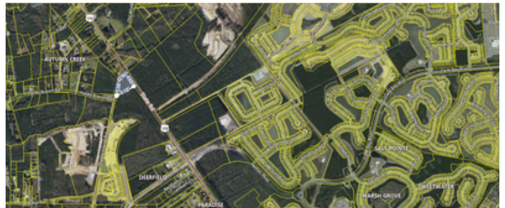
AERIAL VIEW WITH NEARBY PARCELS