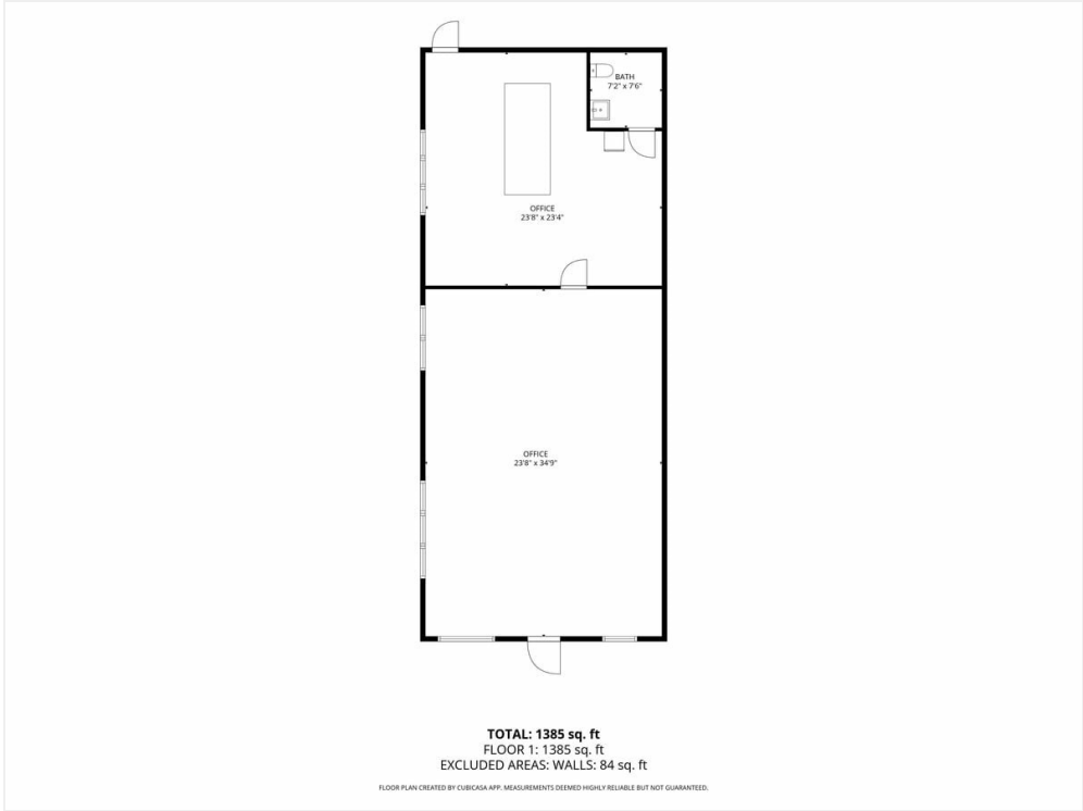
Unit 103 Floor Plan