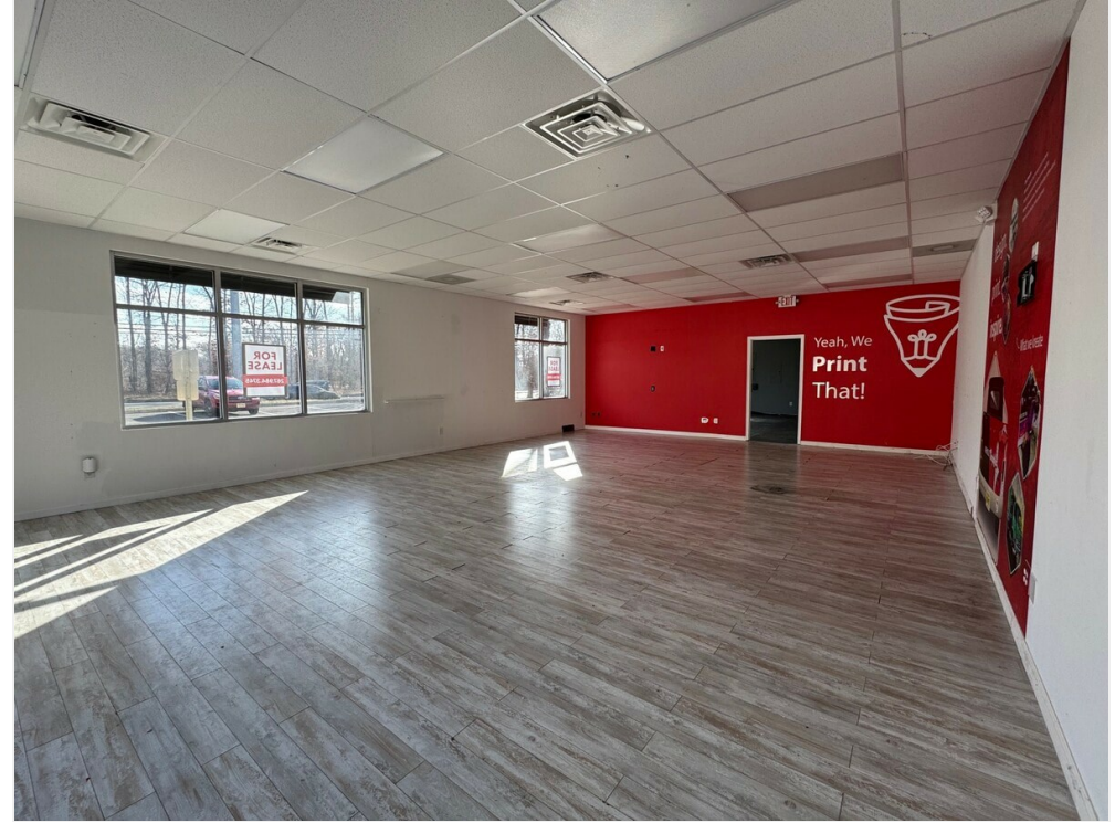
Unit 103-Front Room