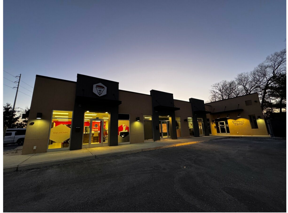
571 Cross Keys Rd