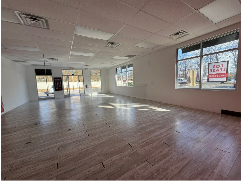
Unit 103-Front Room