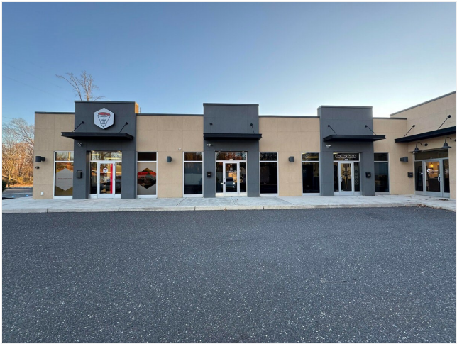
571 Cross Keys Center

571 Cross Keys Rd, Sicklerville, NJ 08081