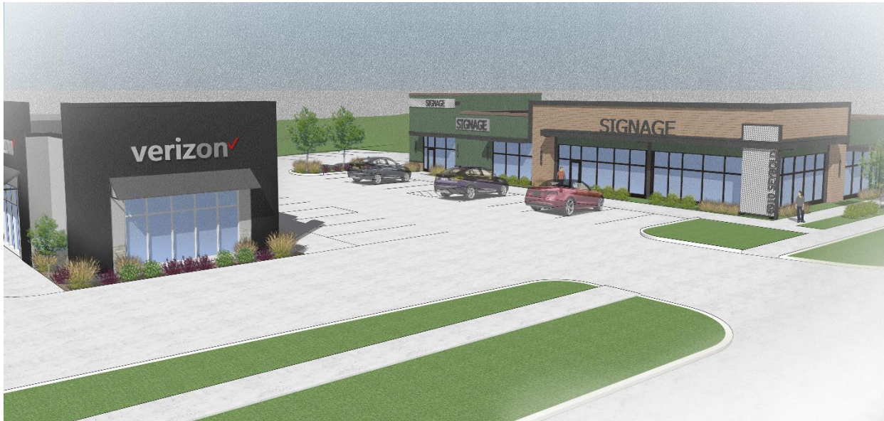
DIMENSION W 6910 Seybold Road - Exterior Perspective