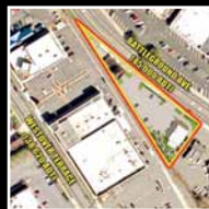
1715 Battleground Greensboro, NC