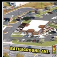
1300 Battleground Greensboro, NC