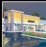
4715 Lawndale Dr. Greensboro, NC