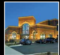
Westover Gallery Greensboro, NC