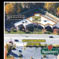
3215 Battleground Greensboro, NC