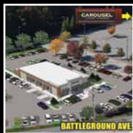
1211 Battleground Greensboro, NC