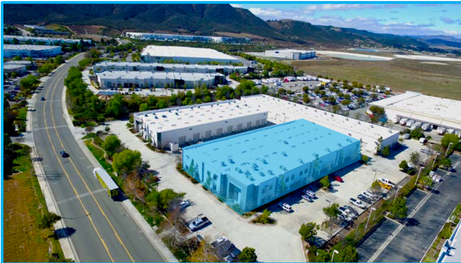
West Side Business Center Location