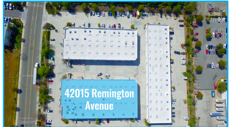
Project Site Plan

41707 Winchester Rd | Suite 300 | Temecula | CA | 92590