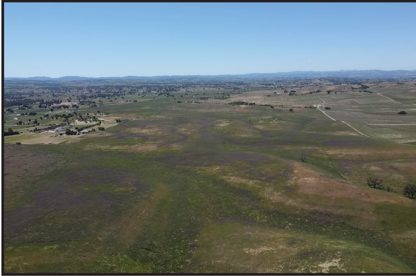
Aerial from East