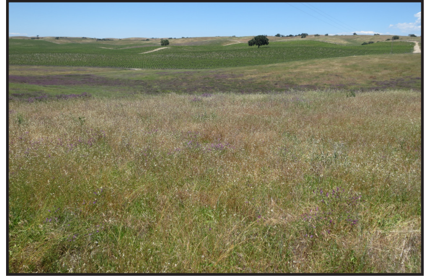
View to North (Neighboring Vineyard)