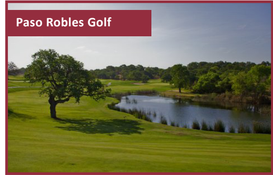
Paso Robles Golf

GOLF - The scenic town of Paso Robles is one of California's best kept secrets. With four golf courses you have a reason to stay awhile and enjoy the local wine and food scene.