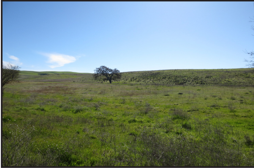
View from Gate 4 Entrance