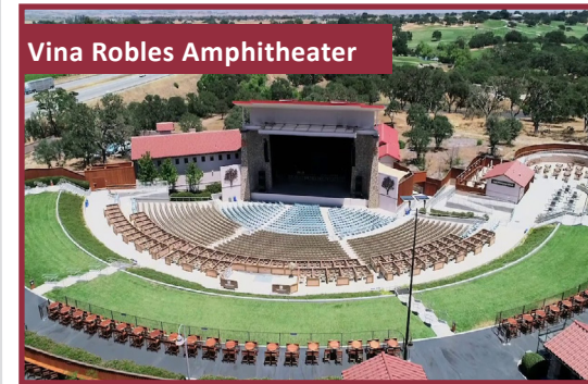
Vina Robles Amphitheater

Entertainment - Nestled on a picturesque, oak-dotted hillside, featuring a variety of music and entertainment. Vina Robles Amphitheater was named one of North America's "Must Play Venues of 2016" by music industry publication Amplify.