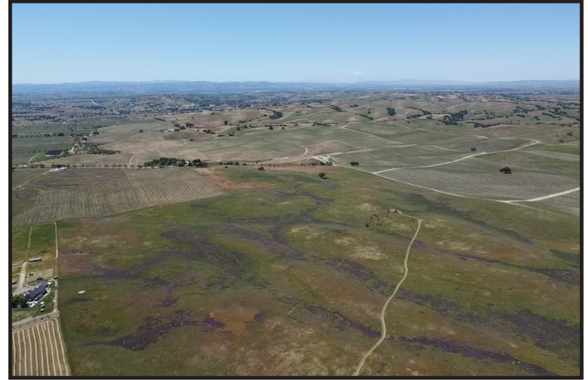
Aerial from Southeast