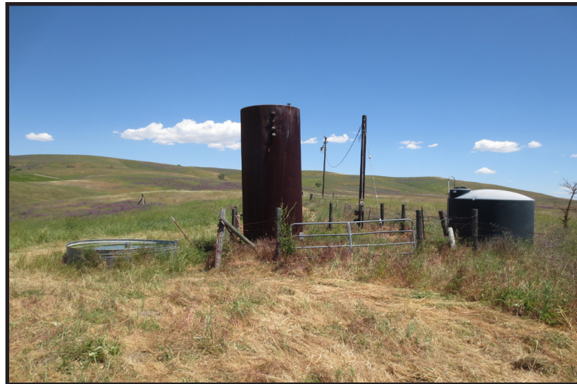
Well and Water Tank