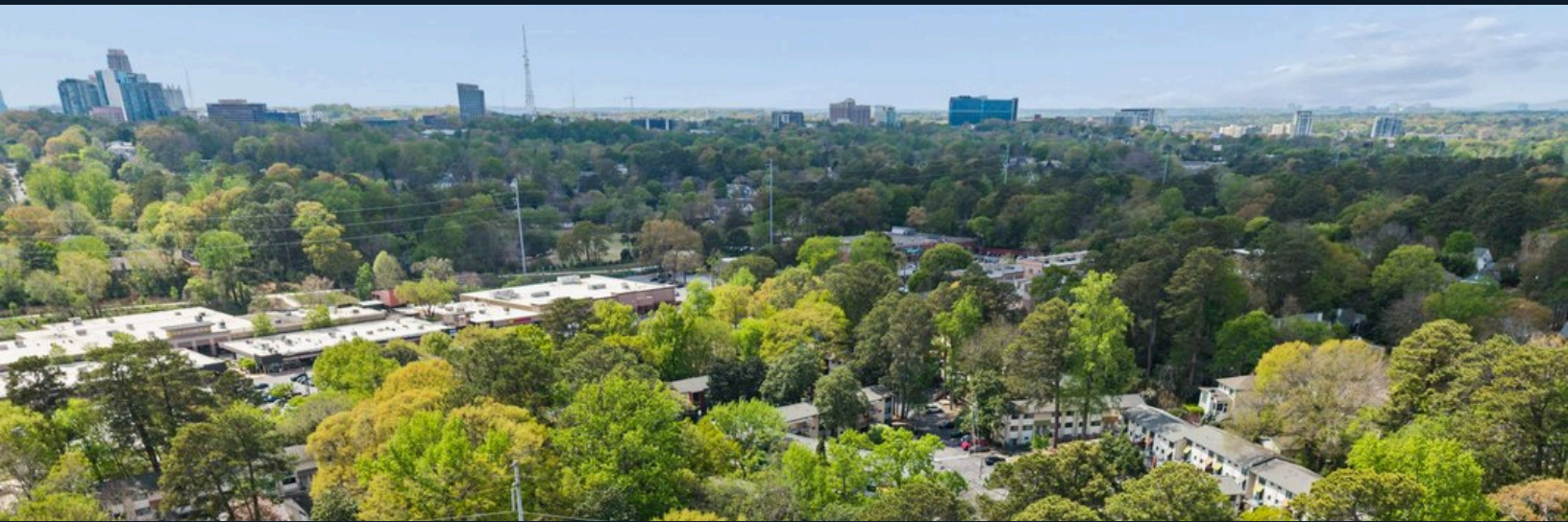
Atlanta Skyline Visible from the Property Corridor — Drone Perspective

MIDTOWN · 1.8 MI SOUTH · BUCKHEAD · 2.5 MI NORTH