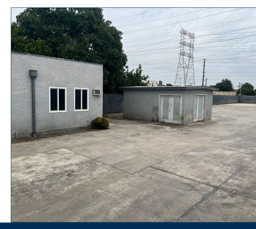
EXCLUSIVELY OFFERED BY: