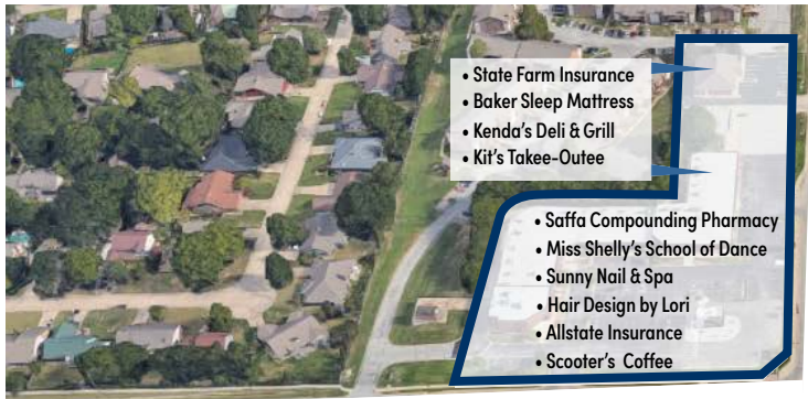
E. 81st Street