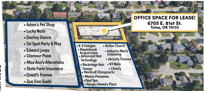
E. 81st Street