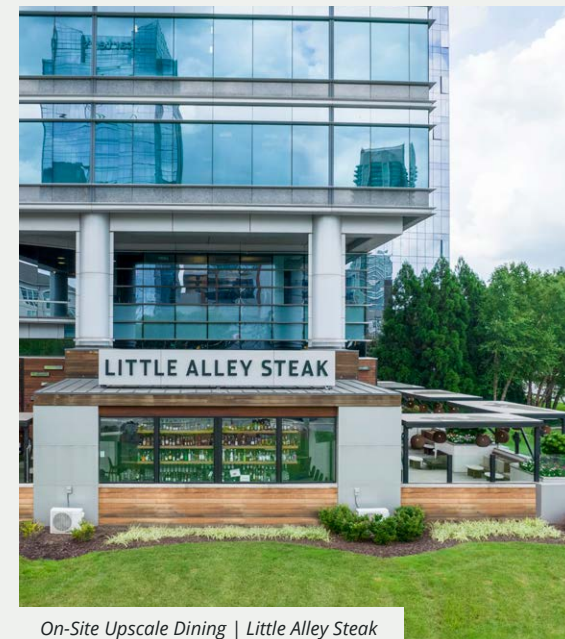
On-Site Upscale Dining | Little Alley Steak