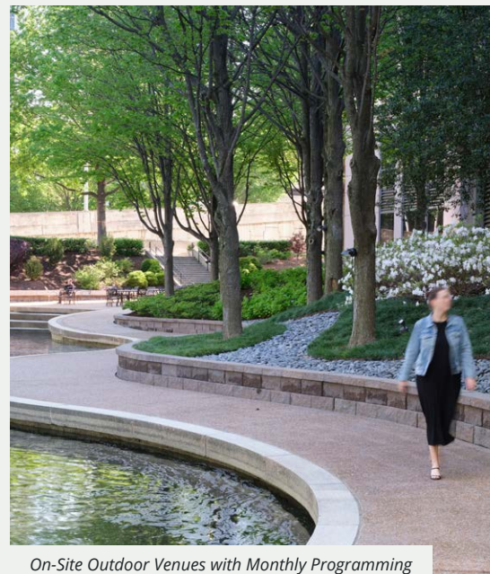
On-Site Outdoor Venues with Monthly Programming