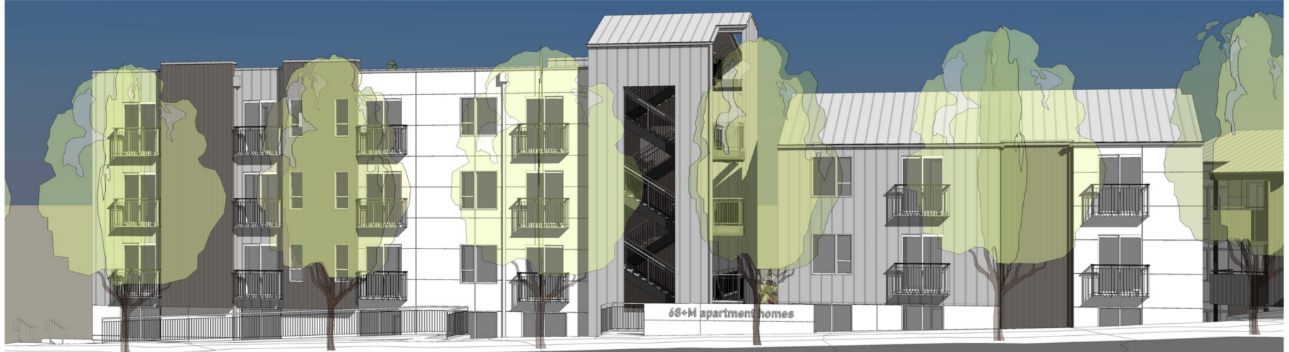
VIEW FROM SW MULTNOMAH BLVD

6715 SW Multnomah Blvd Portland, OR 97223