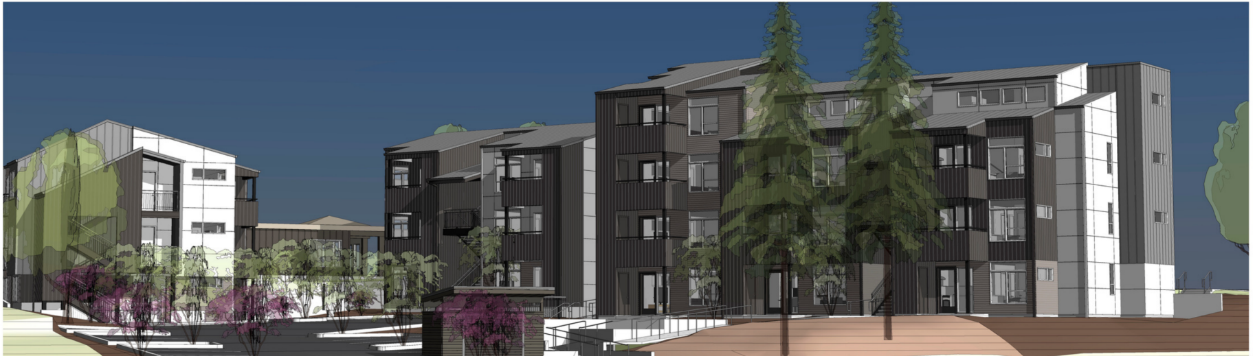
VIEW FROM SW 68th STREET