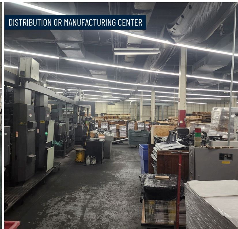
DISTRIBUTION OR MANUFACTURING CENTER