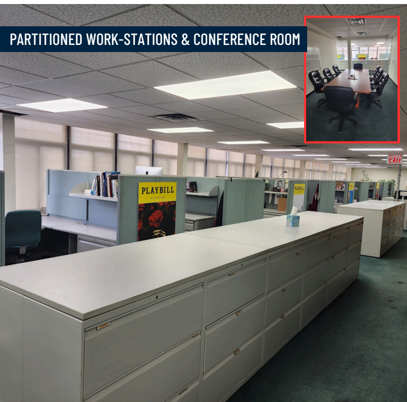
PARTITIONED WORK-STATIONS & CONFERENCE ROOM