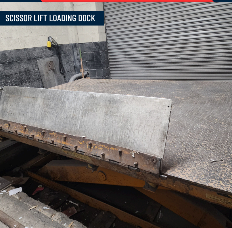
SCISSOR LIFT LOADING DOCK