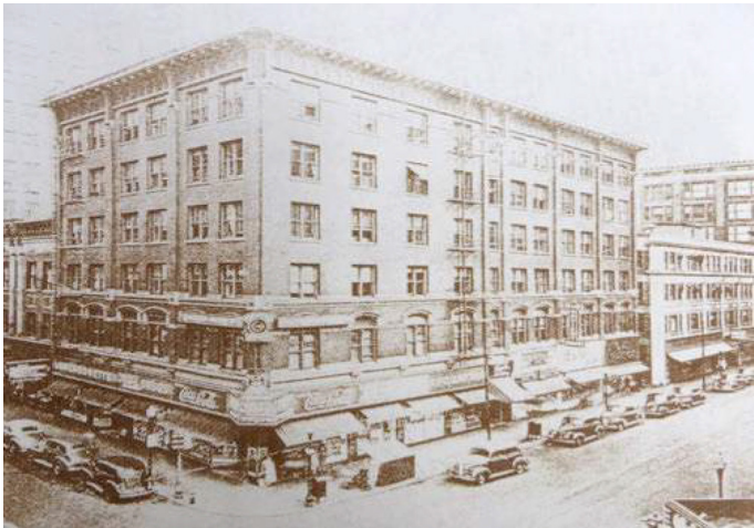
Edna Griffin Building, 1935

Renovations of the Edna Griffin Building are completed, while preserving its historical importance.