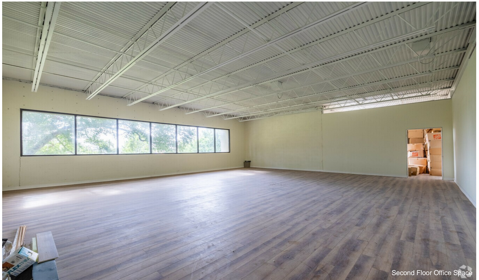
Second Floor Office Space