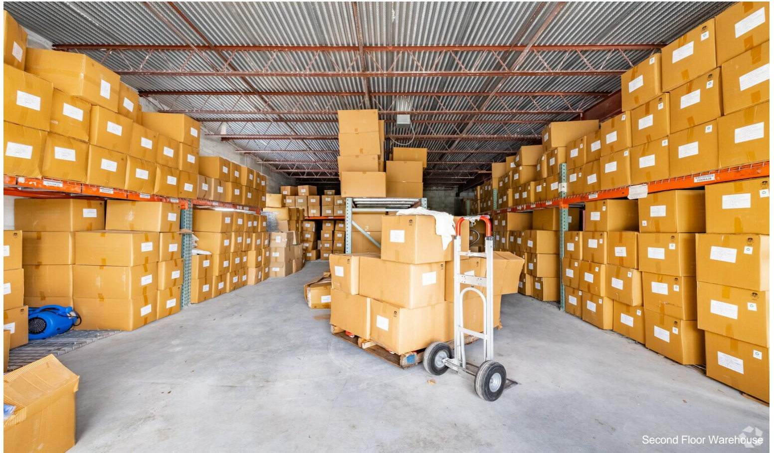
Second Floor Warehouse