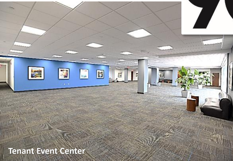
Tenant Event Center