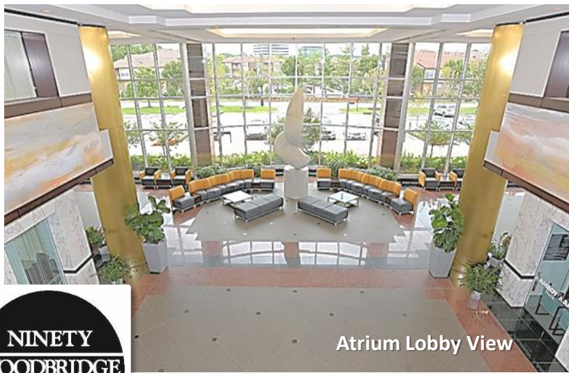
Atrium Lobby View