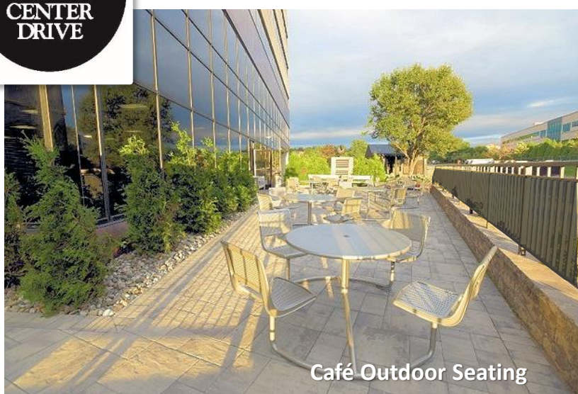
Café Outdoor Seating