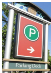
Public Parking Map