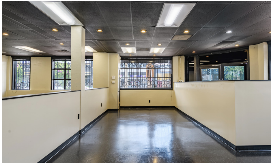
700 Helitrope - 1,435 SF

700 HELIOTROPE DRIVE, LOS ANGELES, CA 90029