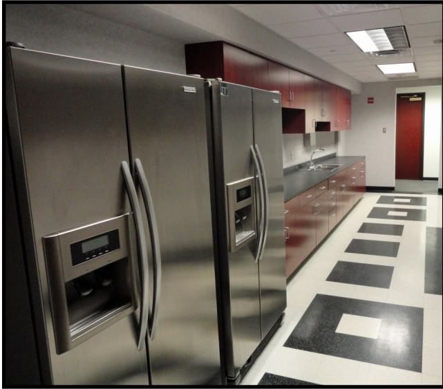
Break Room- Kitchen