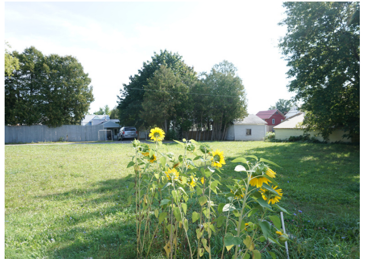
830 State St – Former Convenience Store