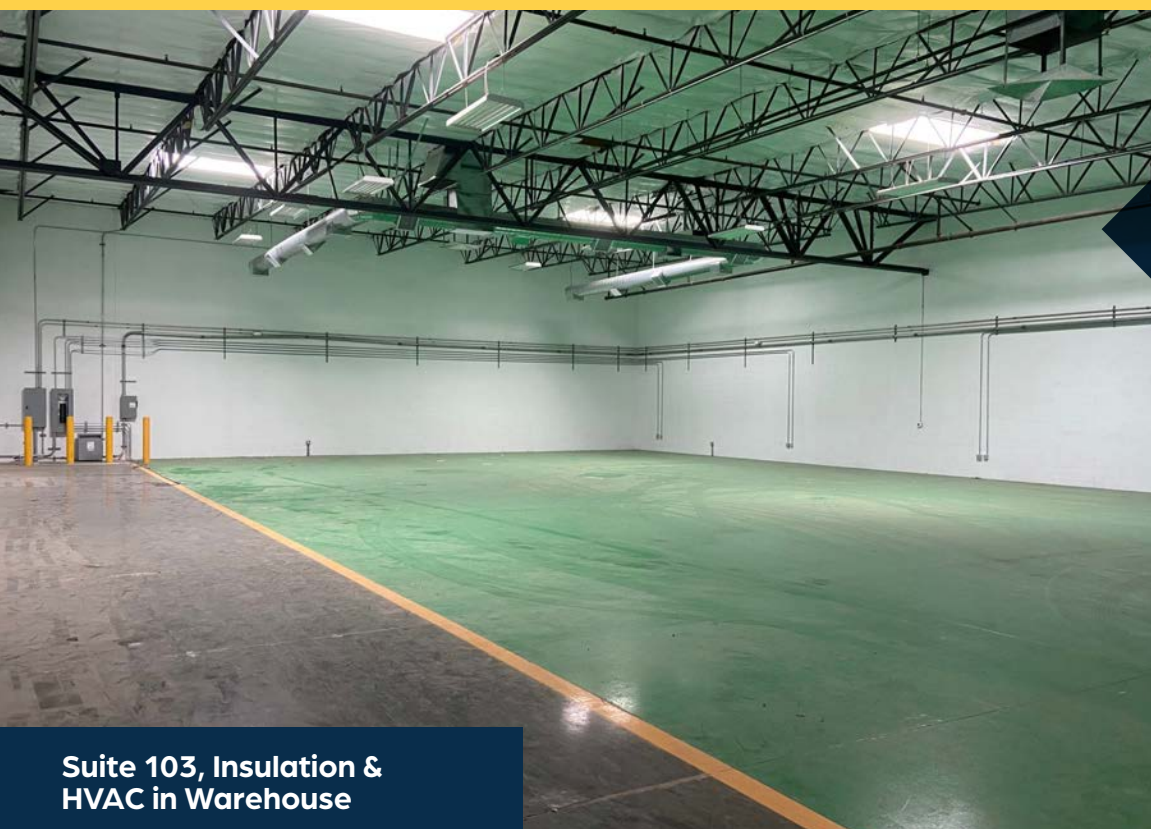
Suite 103, Insulation & HVAC in Warehouse