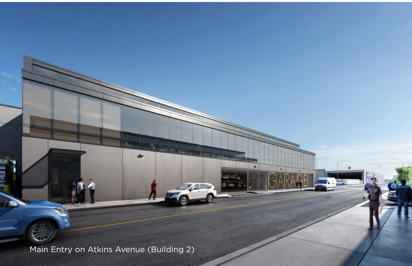
Main Entry on Atkins Avenue (Building 2)