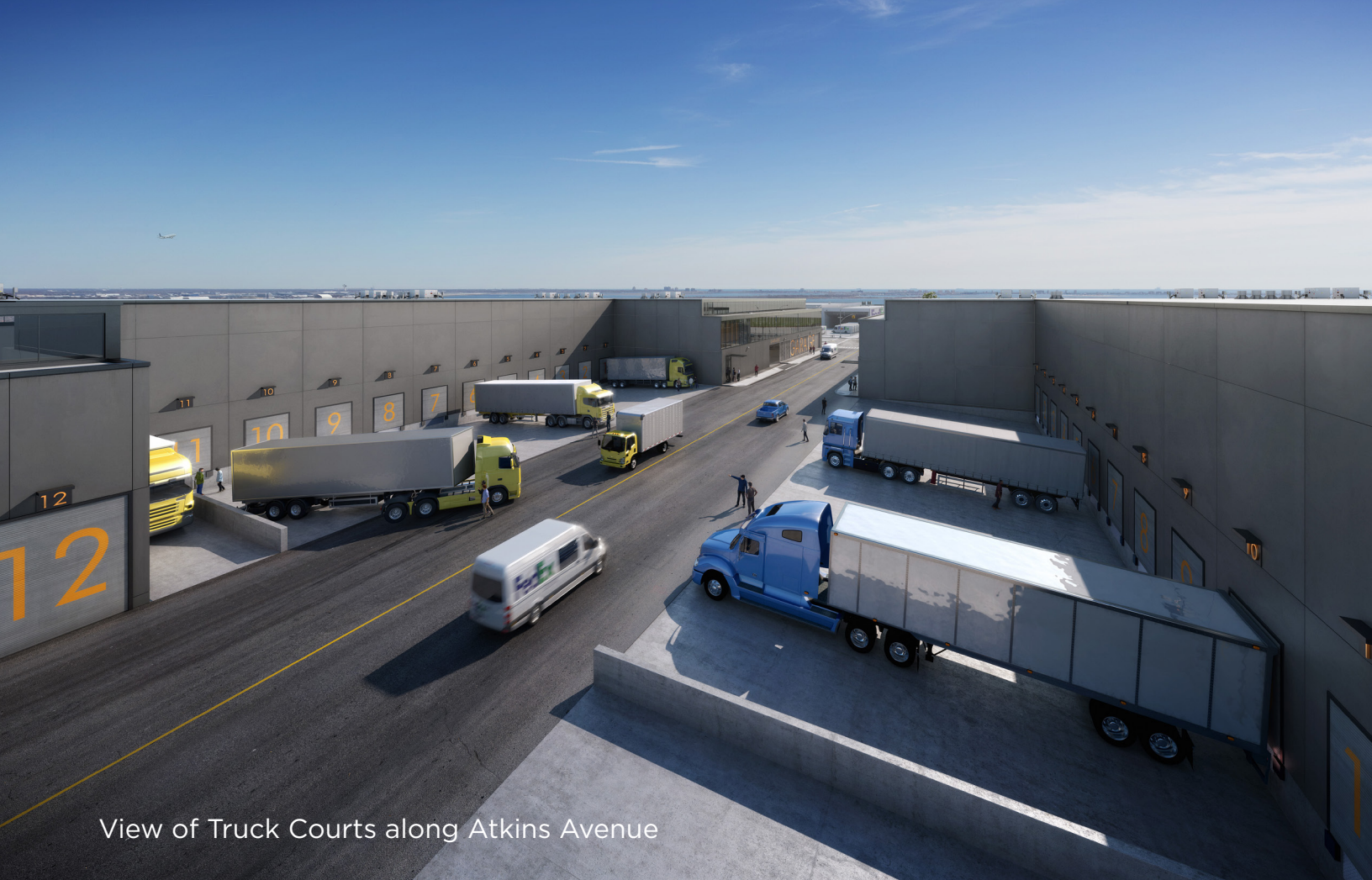
View of Truck Courts along Atkins Avenue