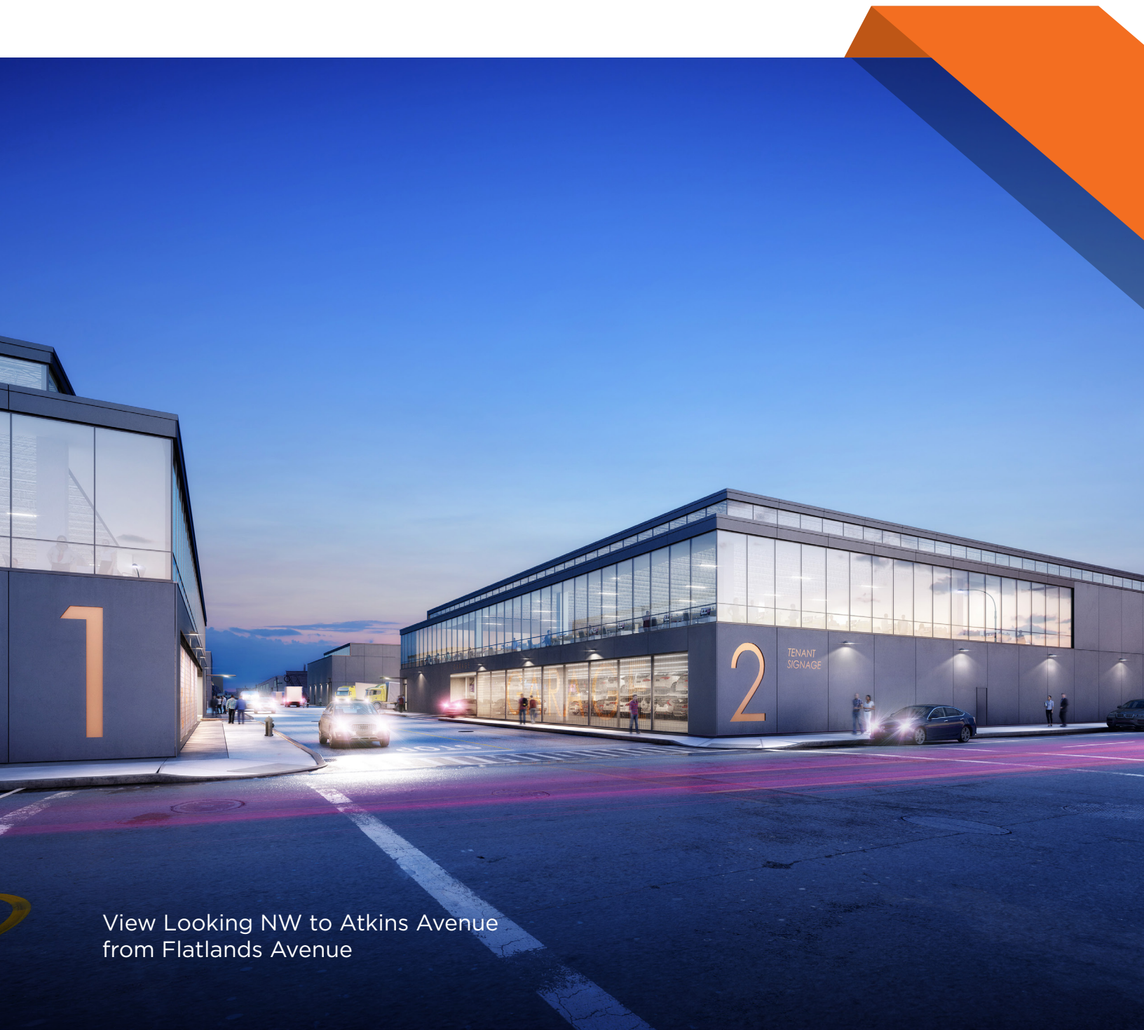
View Looking NW to Atkins Avenue from Flatlands Avenue

BROOKLYN LOGISTICS CENTER is located 5 miles from JFK Airport and 12 miles from Manhattan at the intersection of Flatlands and Atkins Avenues, in Brooklyn, NY. Immediate proximity to FedEx Ground and efficient regional drive times define the site's multi-borough connectivity.