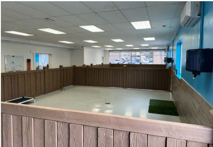
Currently set up as a doggie daycare